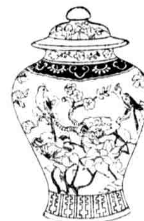
Vase of Nankin crackle curio ware in soft colors.

are $5 to $125. Jardiniere among these porcelains include the famille vert and famille rose, besides the blue-and-white and others; these may be had for $7.50 to $100—the last for a huge blue-and-white jar for a hall or garden.