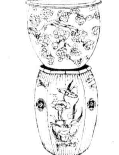
Porcelain garden seat and jardiniere of black-and-white hawthorn ware.

Nankin Crackle Curio Ware with its deep ivory background and its soft gray, blue and rose Chinese figures comes in a variety of charming shapes. Prices run from $2 for a small vase to $25 for a large one. Also there are jardiniere of this ware.