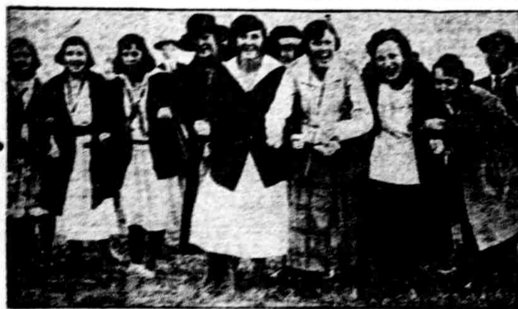
MARLBOROUGH PLAYS AT MOORESTOWN. Two teams seem to be pitted up on a Moorestown High School player, who has the ball. The New Jersey girl players were a busy lot. They made a lot of real football noise.