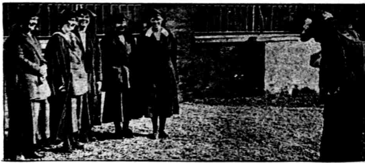
FIRST IN 900 YEARS. Oxford College, England, has conferred degrees on women, the first time in the history of the college. Five of the degree students are being photographed by a friend.