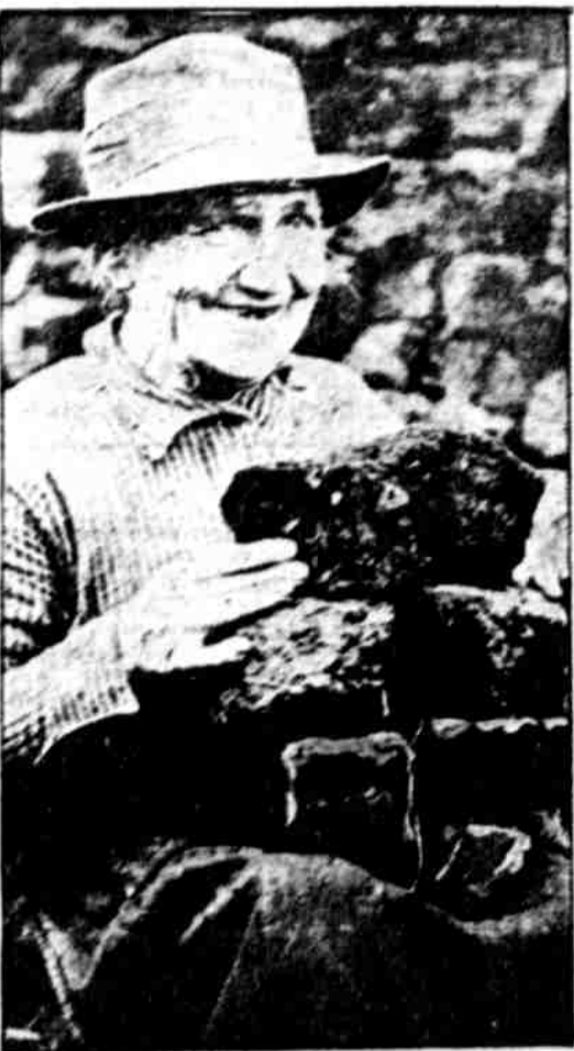
DON'T MIND THE BRITISH COAL STRIKE. She lives near a peat bog, and was told to help herself. She did.