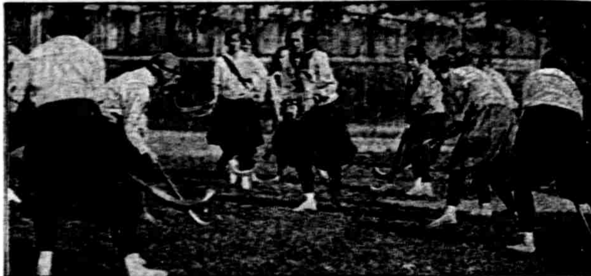
A LITTLE HOCKEY PRACTICE. Girls of the Temple University team getting ready for a game to be played today. They practice at Kingsessing recreation center.