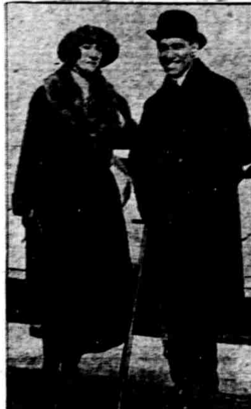
SPAIN'S CHAMPION BULL FIGHTER. He is Juan Belmonte, who has come to the United States with his wife.