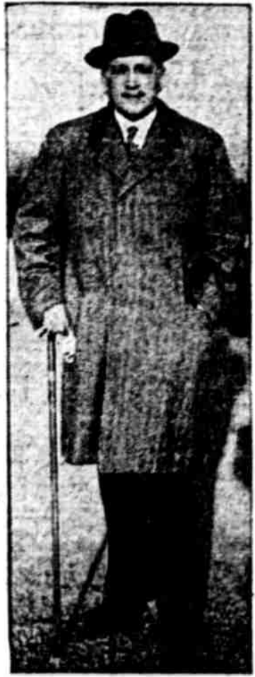
AMBASSADOR FROM ARGENTINA. He is Tomas A. Le Breton, who represented his country at the Paris peace conference.