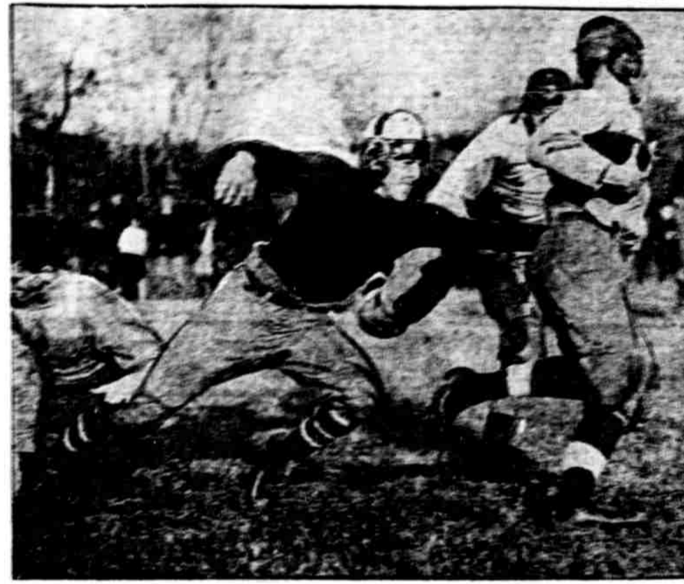
ON THE WAY TO THE SECOND TOUCHDOWN. A Ridley Park player has the ball in the game played against Swarthmore High School, at Ridley Park.