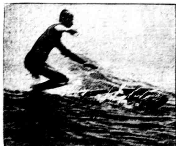
SURF-RIDING IN HONOLULU. The rider is Lord Mountbatten, of England, who is an expert at this waxy sport.