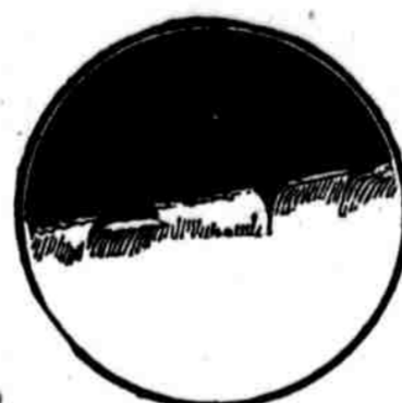
Seen under a powerful magnifying glass an unstropped razor blade looks like a saw edge