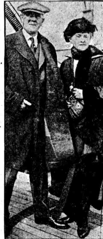
POLITICS ALL OVER FOR A TIME. So John W. Davis, U. S. ambassador to Great Britain, and Mrs. Davis, sail aboard the Aquitania. Mr. Davis' name was placed before the Democratic convention.