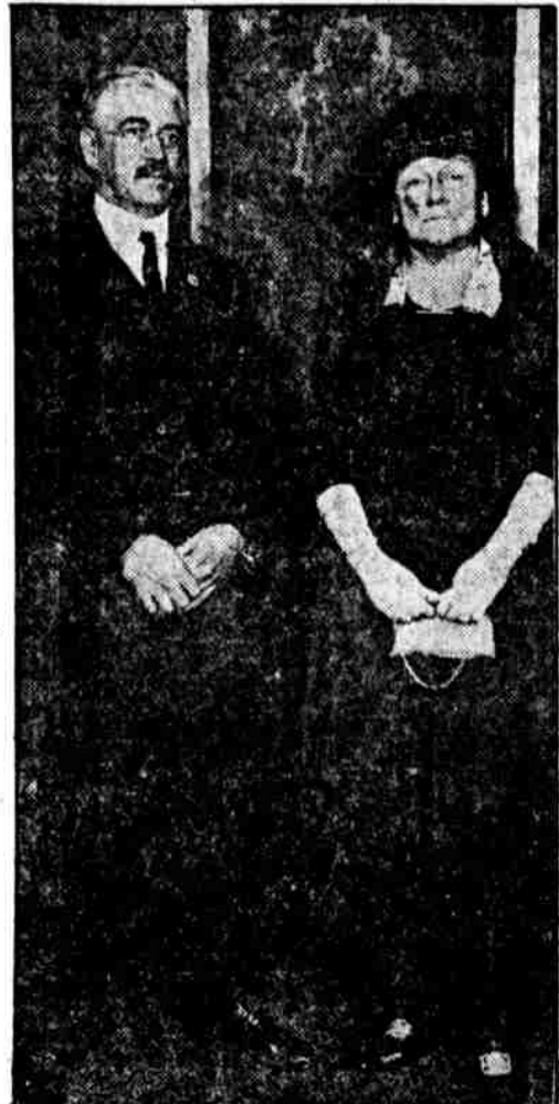
NEW GOVERNOR OF NEW YORK, AND WIFE. Official returns indicate that Judge Nathan L. Miller, Republican candidate for governor of New York, has been elected.