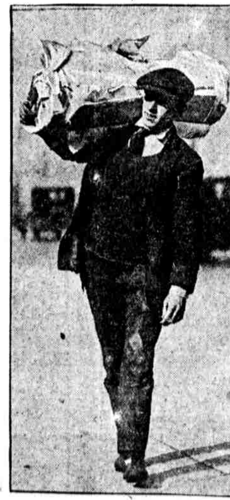
IT'S A BIG JOB NOW. With the election records from an uptown division, the clerk arrives on the north plaza of City Hall.