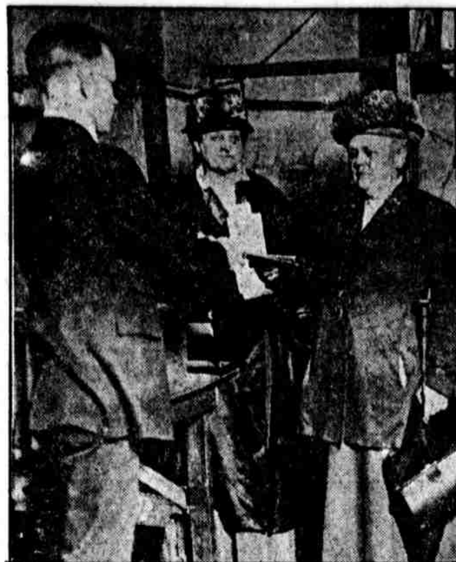
FIRST VOTE FOR PRESIDENT. Mrs. Carrie Chapman Catt and Miss Mary Garrett Hay, two of suffrage's active workers, voting on Broadway, N. Y.