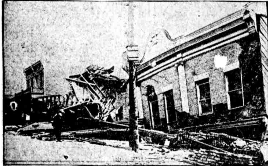
DAMAGED HOUSES IN SCRANTON. The sinking earth, due to mine caves, continues to wreck property in the Lackawanna county city.