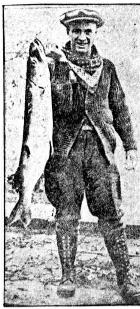
CHANGE OF SCENERY. Tris Speaker, who a few weeks ago was leading the Cleveland Indians against the Dodgers of Brooklyn in the world series, now fishing in Canada.