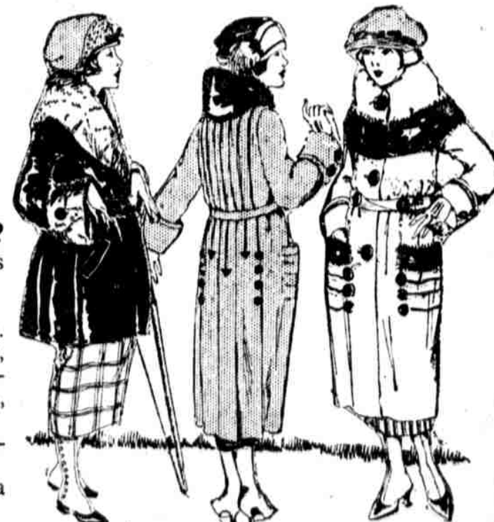
Three of the Coats at $23