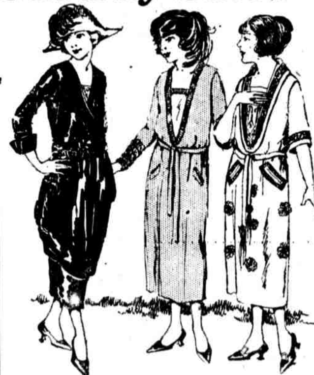
Three of the Dresses at $20