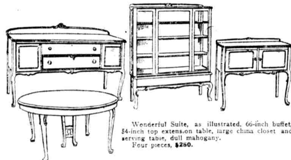
Wonderful Suite, as illustrated, 66-inch buffet, 54-inch top extension table, large china closet and serving table, dull mahogany. Four pieces, $250.

4-Piece Queen Anne Dining Room Suite. Half Price at $250