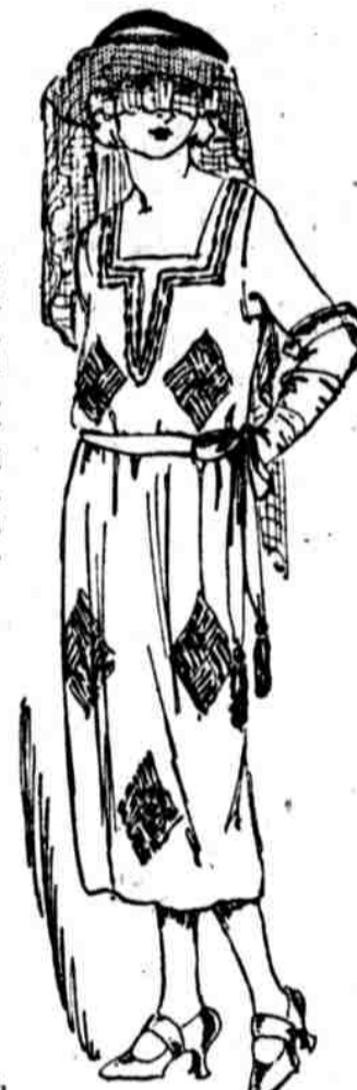
Women's Tricootine Dress—With Beads Massed In a Square—$48. Half Price.