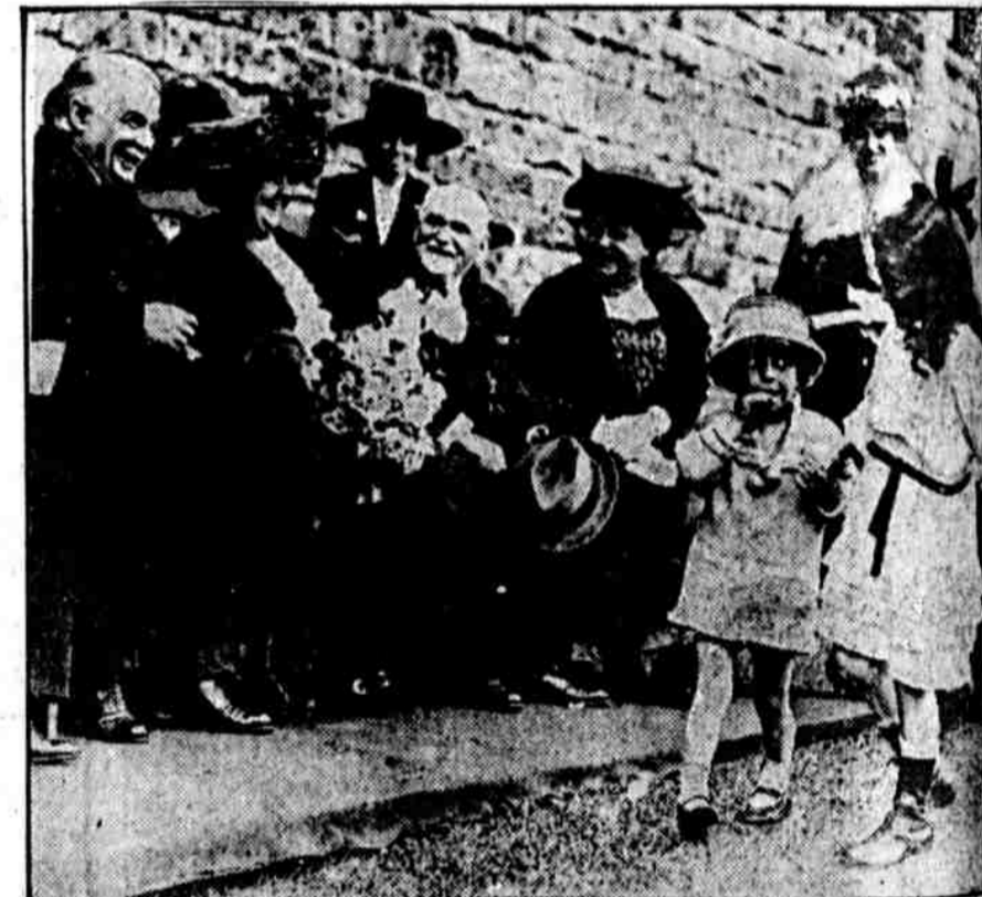
SHY TOT. The shyness of the little girl, who has just presented Mrs. Lloyd George with a large bouquet of flowers, amused the premier and his party.