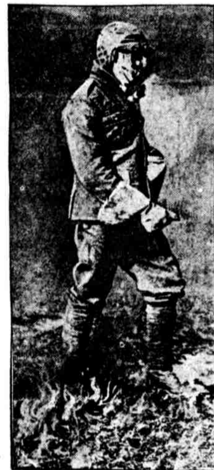
WALKING THROUGH FIRE. A British soldier has invented a solution which will resist fire. This demonstration shows the inventor in soldier's uniform.