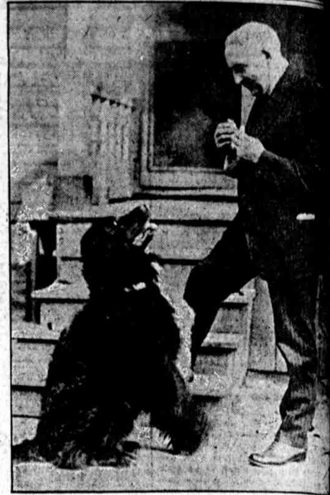
"SIT UP." Senator Harding entertaining a visitor at his home in Marion, Ohio. The neighbor's dog knows he'll get treated right if he sits up nicely.