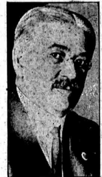
CANDIDATE FOR GOVERNOR OF NEW YORK. Judge Nathan L. Miller, who is making a whirlwind tour of that state as a Republican candidate.