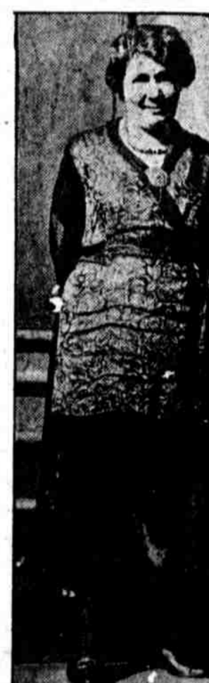
ENGLISH SUFFRAGE LEADER. She is Mrs. Pethick-Lawrence, who speaks on "Immediate World Disarmament," at the Bellevue-Stratford today.