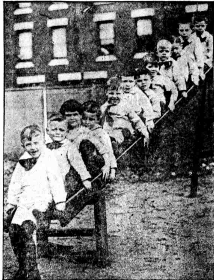
A NIFTY DOZEN. These twelve lads, who live at the Northern Home for Friendless Children, Twenty-third and Brown streets, really use this sliding board, but they wanted to pose a bit.