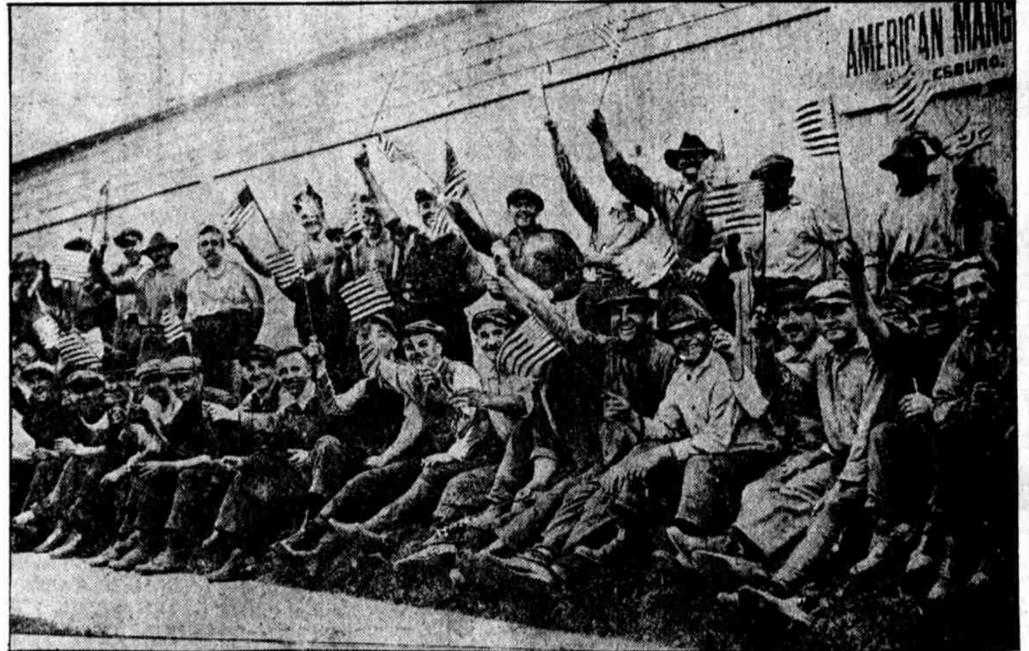
A BOUSING RECEPTION. Employees of the American Manganese Bronze Company, of Holmesburg, were equipped with American flags and good voices, which they used, as Mrs. Theodore Roosevelt arrived at the Holmesburg station yesterday morning to attend the dedication of Roosevelt Boulevard.