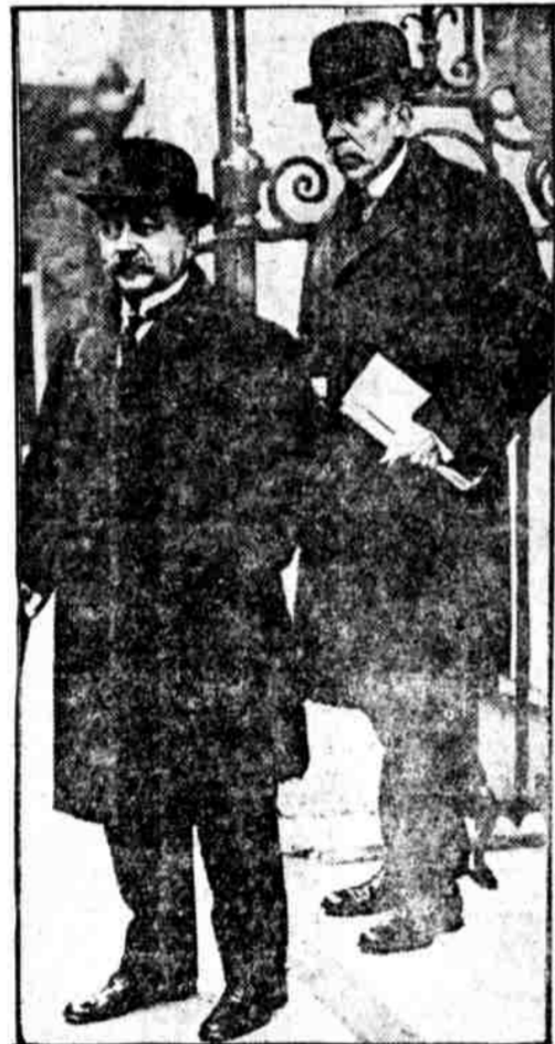
DEBELACROY, the Belgian premier, and the Belgian ambassador to England, leaving Downing street, London, after visiting Lloyd George.