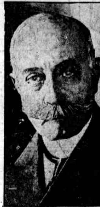
MAY BE MADE REGENT OF GREECE. Admiral P. Coundouriotis, former Greek minister of marine, is mentioned for the post.