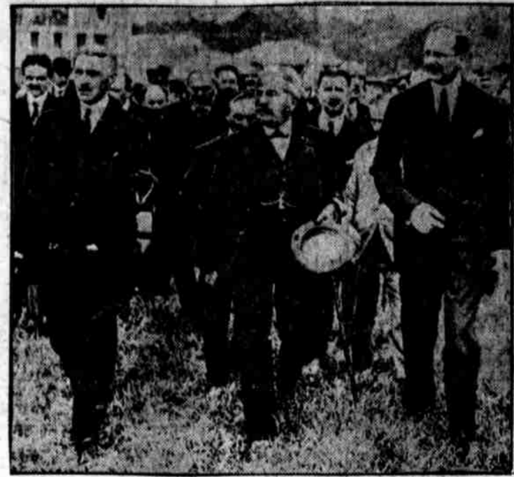
OPENING OF FRENCH AVIATION TOURNAMENT. President Millerand of France accompanied by officials arrive at the Bleriot aerodrome, at Buc, near Paris, to open the airplane classic. The tall man is M. Flandin, French Air minister.