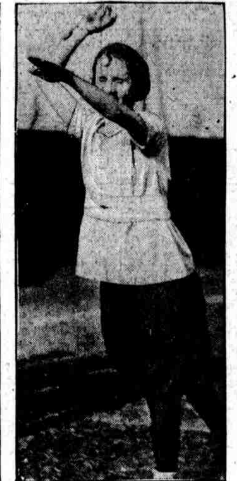
MME. MILLERAND. A new photograph of the wife of the president of France.