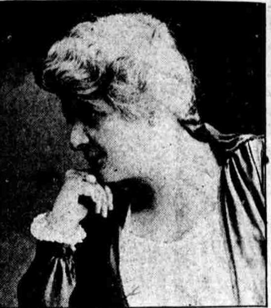
MME. MILLERAND. A new photograph of the wife of the president of France.