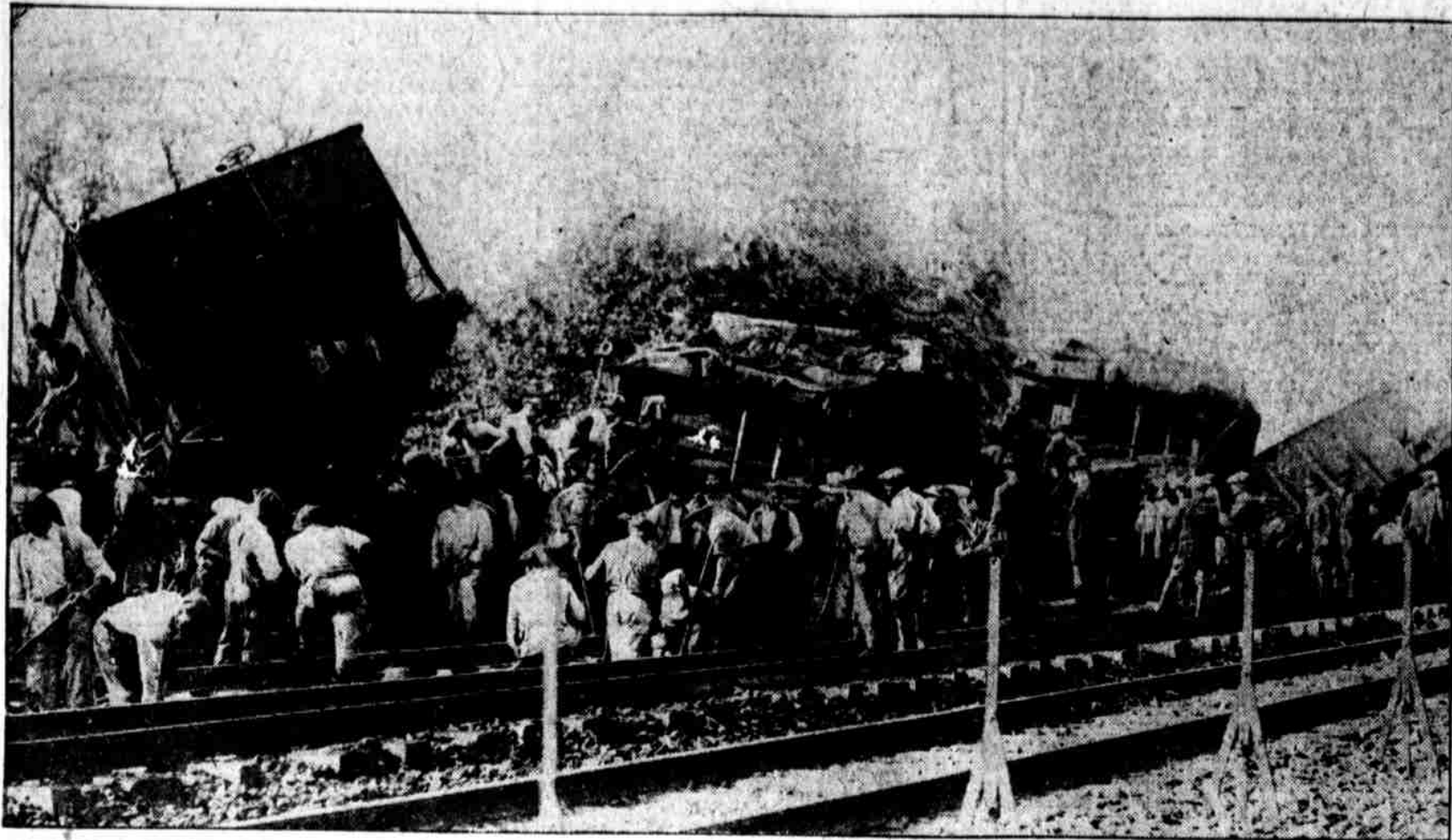
CLEARING TRACKS. This group of workmen and many others worked all night removing the wreckage from and repairing the Pennsylvania Main Line tracks at Radnor, following the wreck of Sunday. At noon today No. 1 track was still closed to traffic.