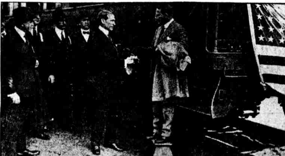
TWO GOVERNORS MEET. Governor Cox being welcomed into New Jersey by Governor Edwards as the presidential candidate starts his New Jersey campaign.