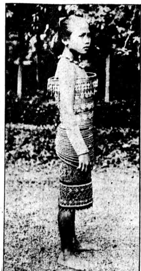
A BORNEO DEBUTANTE. This maiden of Sarawak, Borneo, is one of the beauties of the Dyak tribe. Much brass wire is included in her costume.