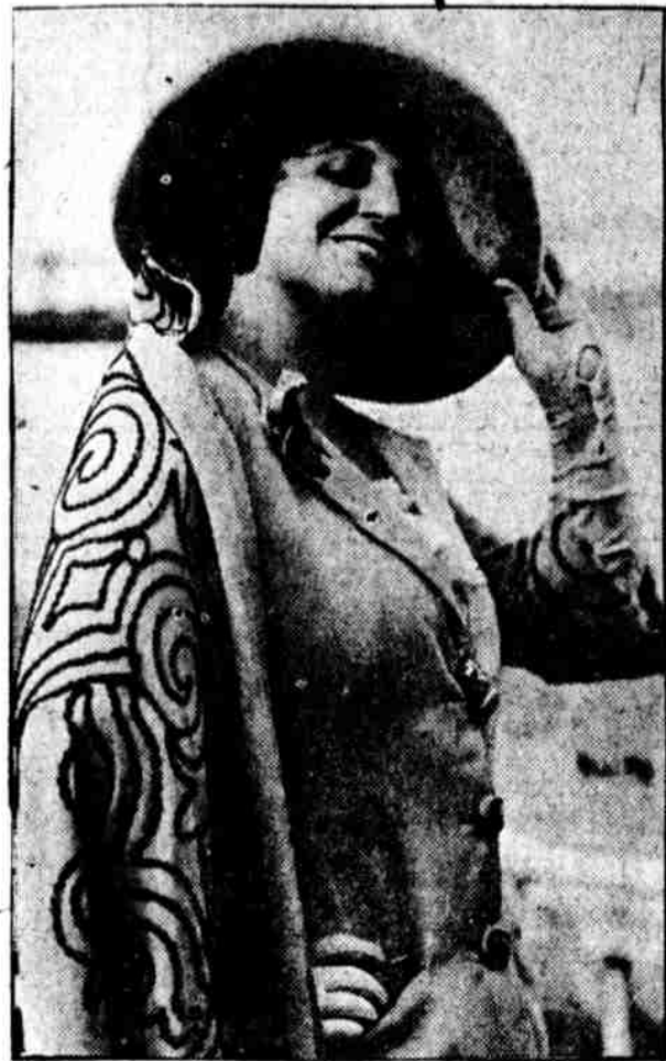
CLAUDIO MUZIO. The soprano of the Metropolitan Opera House of New York, who has returned from a South American trip.