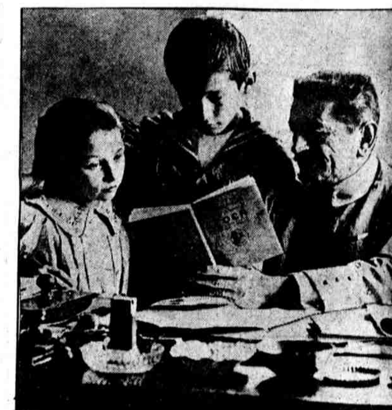
FRENCH GENERAL AND CHILDREN. General Mangin is explaining some points in the book, which is on the life of General Foch. There are six other children in the Mangin family