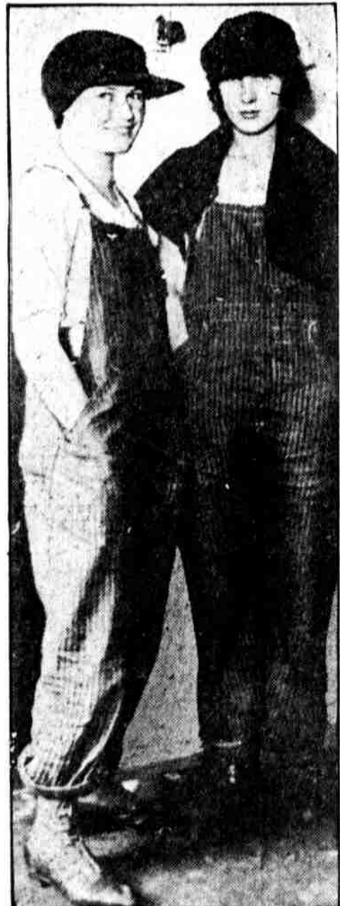
GOT AS FAR AS CHICAGO. Two New Castle (Pennsylvania) girls started to see the country, but became homesick and were caught on way back