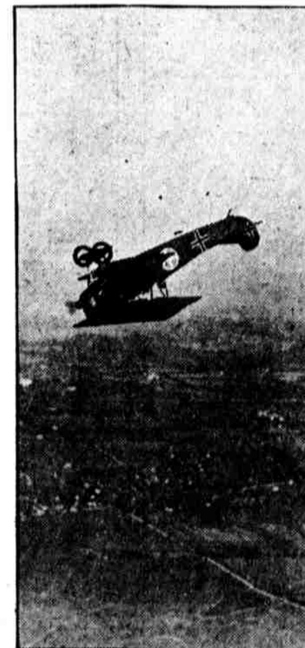
LOOPING THE LOOP. This remarkable photograph was taken from an army airplane over Langley Field, Virginia