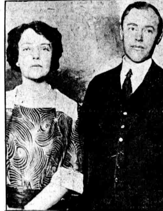
HELPING REPUBLICAN CAUSE AT CINCINNATI. They are Mrs. Alice Roosevelt Longworth and Robert Taft. Both have done much campaign work throughout the country

THESE PHOTOGRAPHS WERE TAKEN AT THE ROSE TREE MEET YESTERDAY AFTERNOON