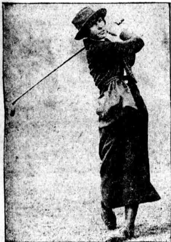
OPPONENTS IN FINALS TODAY. They won their matches in the semifinals of the Berthelyn women's golf cup match, over the Huntingdon Valley course yesterday.