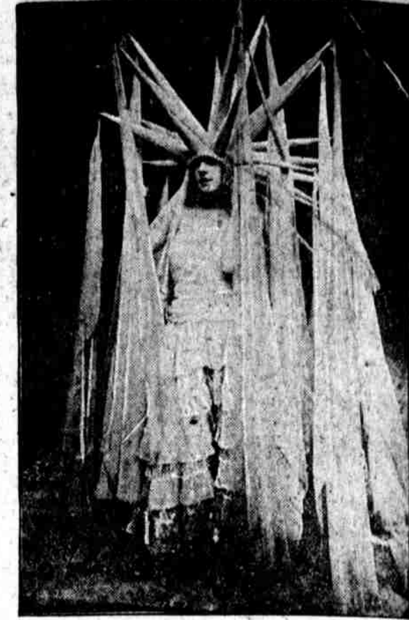
SURE ECCENTRIC. This costume is being worn by a chorus girl in a show being played in London. It's the work of Paul Poiret, a Paris designer.