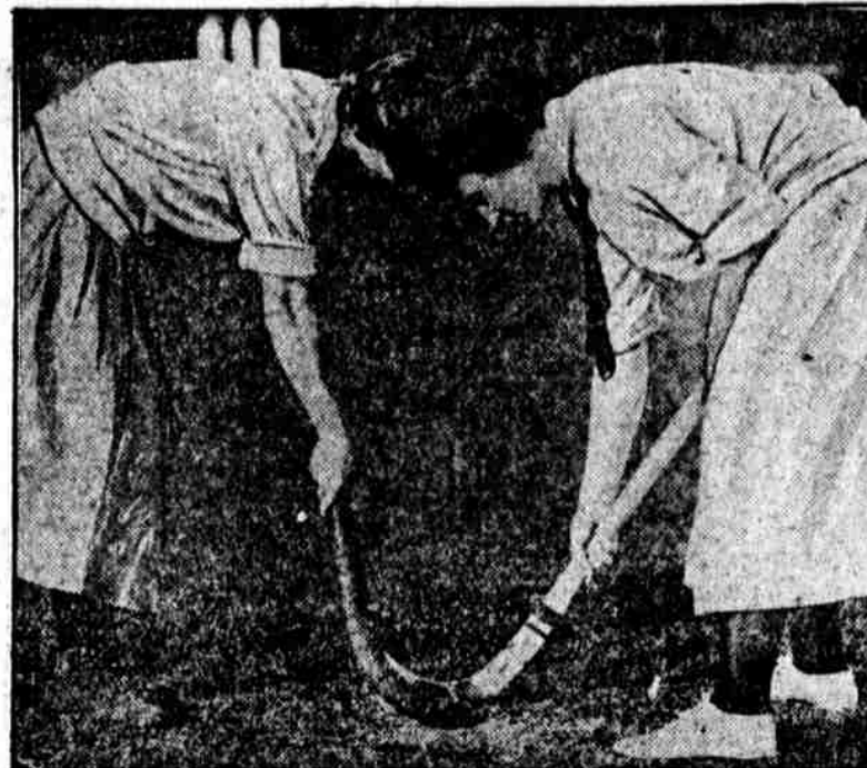
THE START. This is the way a hockey game starts. Opposing players hold sticks against the hockey ball until play is called.