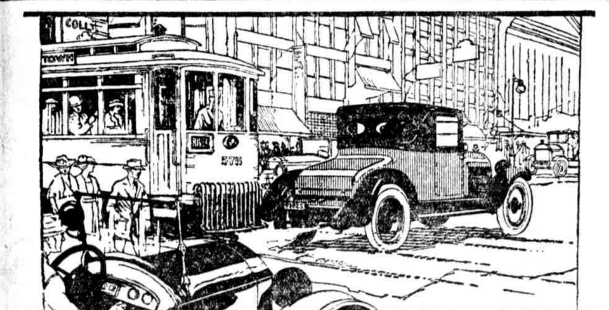
The Hudson Super-Six Cabriolet