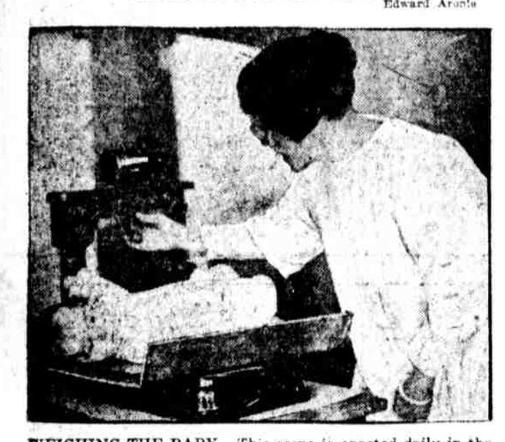
WEIGHING THE BABY. This scene is enacted daily in the clinic of the Babies' Hospital. Ninth and Pine Streets