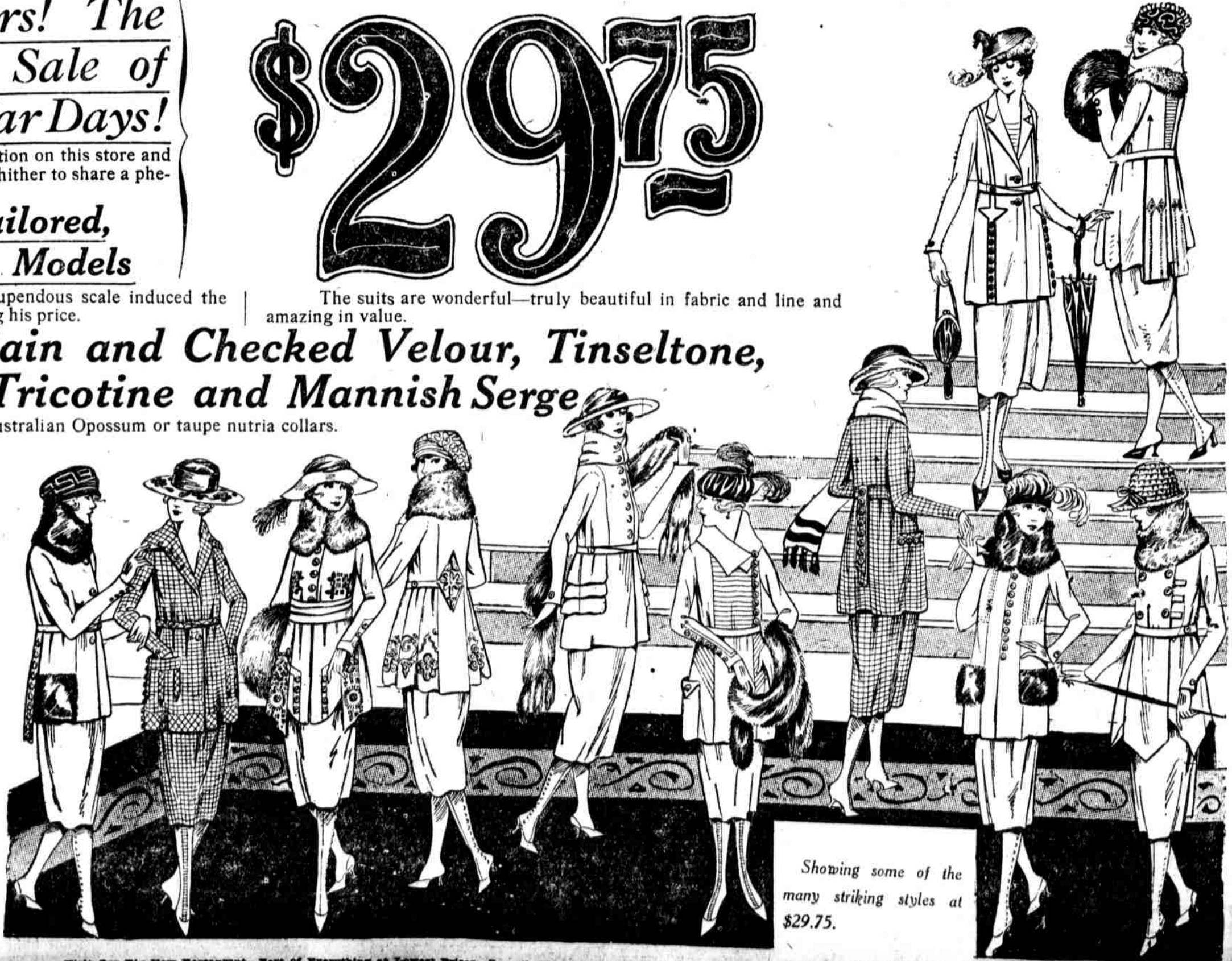
Showing some of the many striking styles at $29.75.

No Mail or Phone Orders. None Sent on Approval. Lit Brothers—SECOND FLOOR