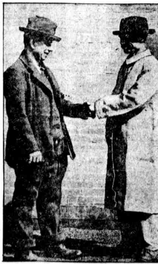
HOW DO YOU LIKE THEM? These men are wearing paper clothes, a part of the exhibition at the Chamber of Commerce.