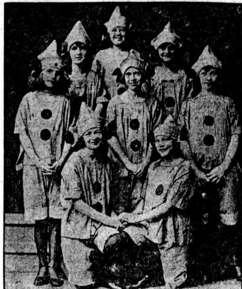
LIVE LETTER BLOCKS. These eight girls will take part in the Y. W. C. A. production of "Fi-Fi" at the Metropolitan Opera House next week.