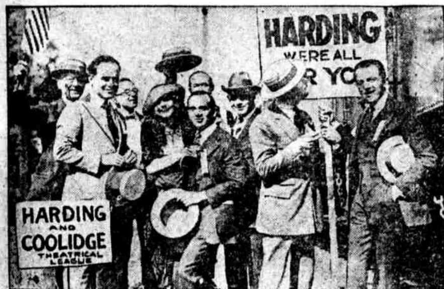
THE THEATRICAL EXCURSION. Scores of theatrical folk, connected with the Harding and Coolidge Theatrical League, went by special train to greet Senator Harding at Marion, O. Among those in the group are Leo Carillo, Al Jolson and Eugene O'Brien.