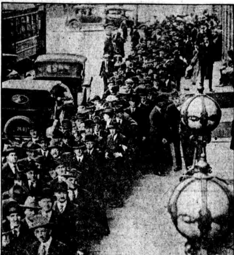
READY FOR INITIATION. Looks like a line-up for the bleacher tickets at a world series baseball game, but it isn't. These men were last night initiated into the series of the Lu Lu Temple, of Mystic Shrine, at the Metropolitan Opera House.