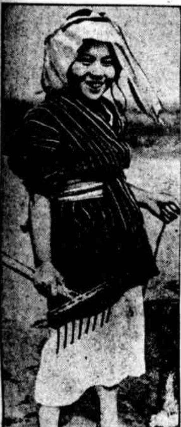
A CLAM DIGGER. She's very well dressed to be working, but the happy Japanese girl has the clam-digging outfit with her.