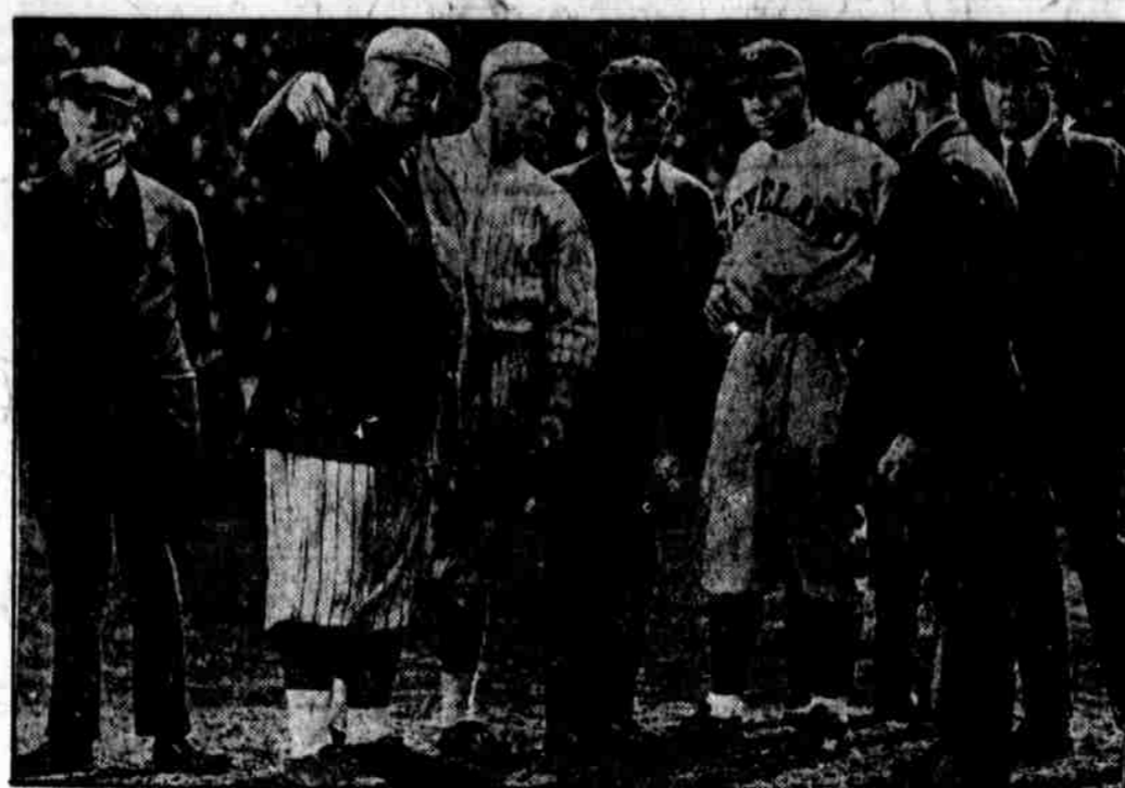
A CHAT ON GROUND RULES. In the group are Umpire Connolly, Manager Robinson, of Brooklyn; Wheat, captain of Brooklyn; Umpire O'Day, Manager Speaker, of Cleveland; Umpire Klem and Umpire Dineen, left to right.