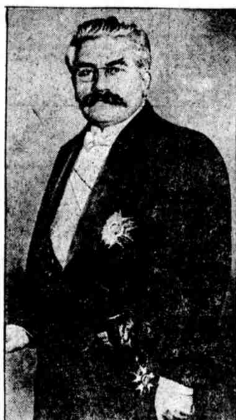
PRESIDENT OF FRANCE. Alexandre Millerand, new head of the French Government.