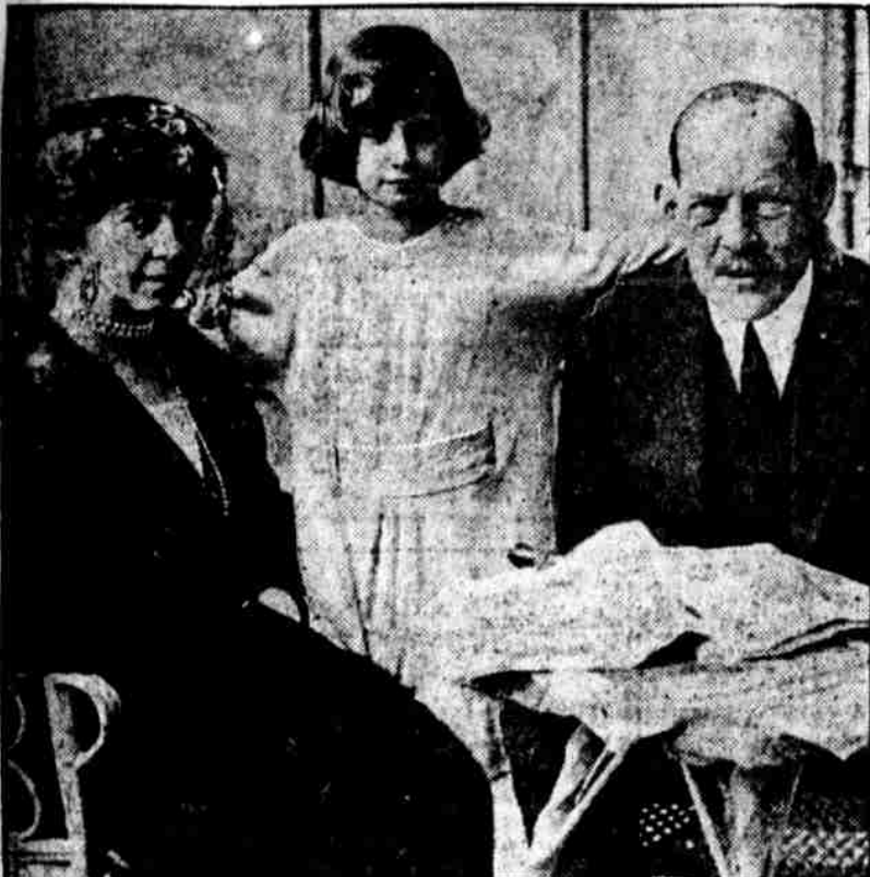
IN SWISS RETREAT. Ex-King Constantine and former Queen Sophie, of Greece, with their youngest daughter, Catharine, at Lucerne, Switzerland.