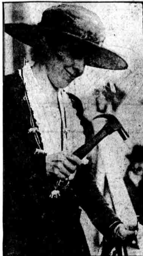
DRIVING THE LAST NAIL. Mrs. Calvin Coolidge, wife of the Republican nominee for Vice President, putting the finishing touch to the front porch at the Hotel Vanderbilt, New York. It is to be used in the campaign by Republican women leaders.