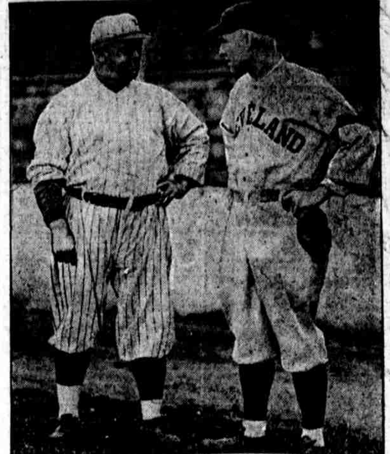
RIVAL MANAGERS. Manager Wilbert Robinson, of the Dodgers, and Manager Speaker, of the Indians, chat before start of play.