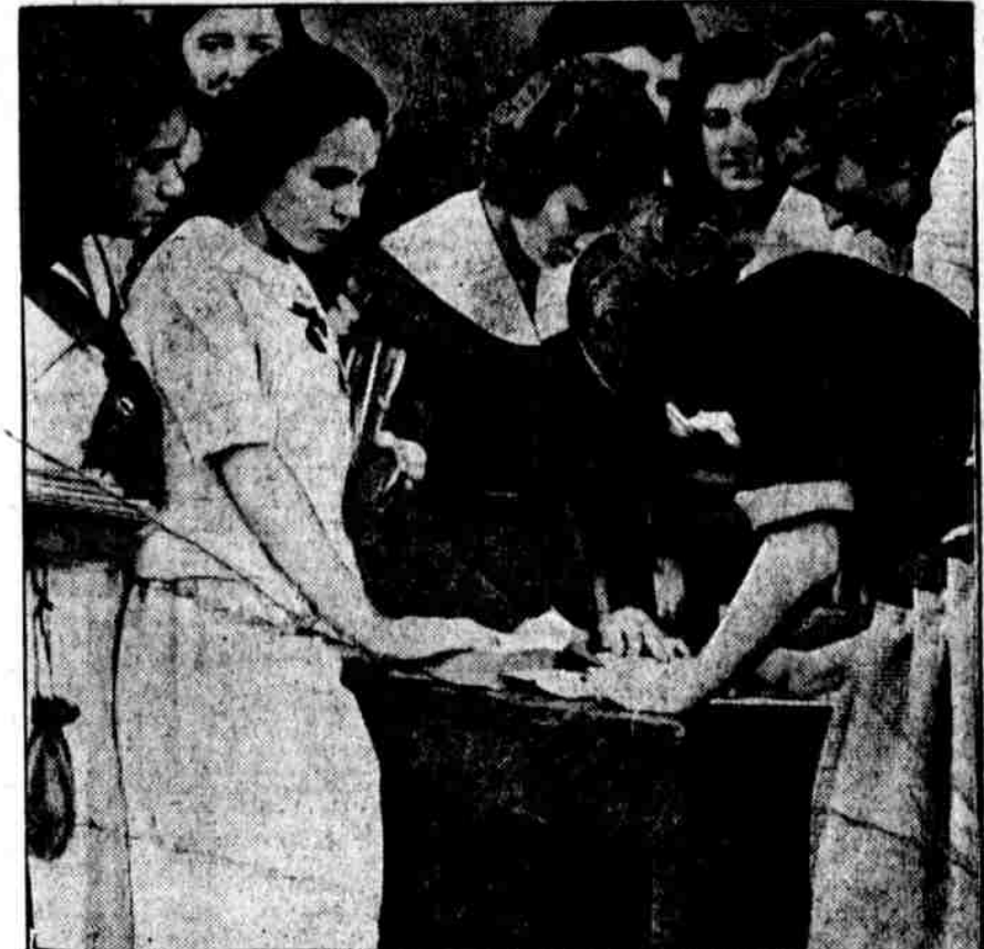
SCHOOL GIRLS "REGISTER." There will be a "Presidential Election" at the West Philadelphia High School for girls on November 2. For this reason the Sphinx Club held its "registration day" yesterday. Everything was conducted according to the style of a real division registration.