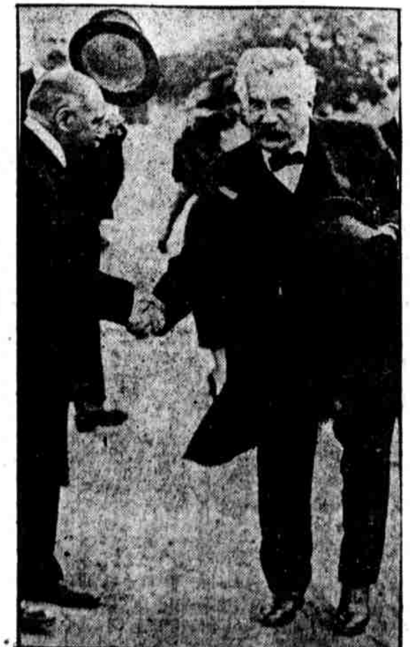
CONGRATULATIONS. President Millerand (right), of France, being congratulated by an old friend after he had taken the oath of office.