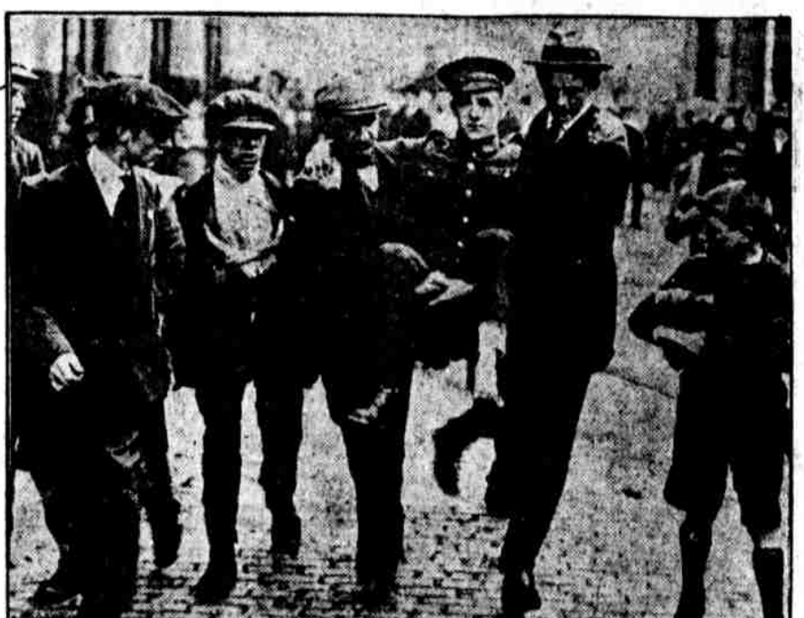
THEY ARE FIGHTING IN DUBLIN. Casualties in connection with the Irish situation continue. A wounded soldier is being carried to a hospital by civilians.