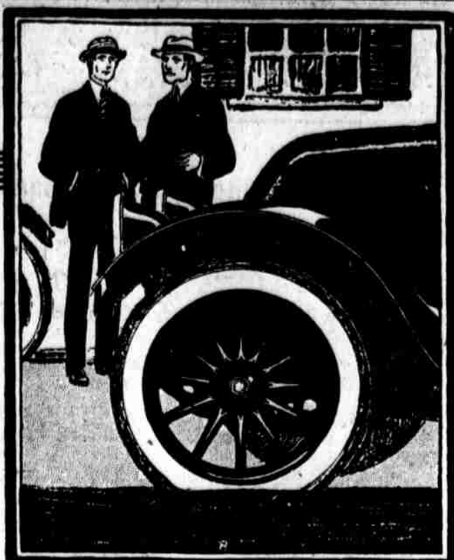
Do you get 12,500 miles to the set of tires?