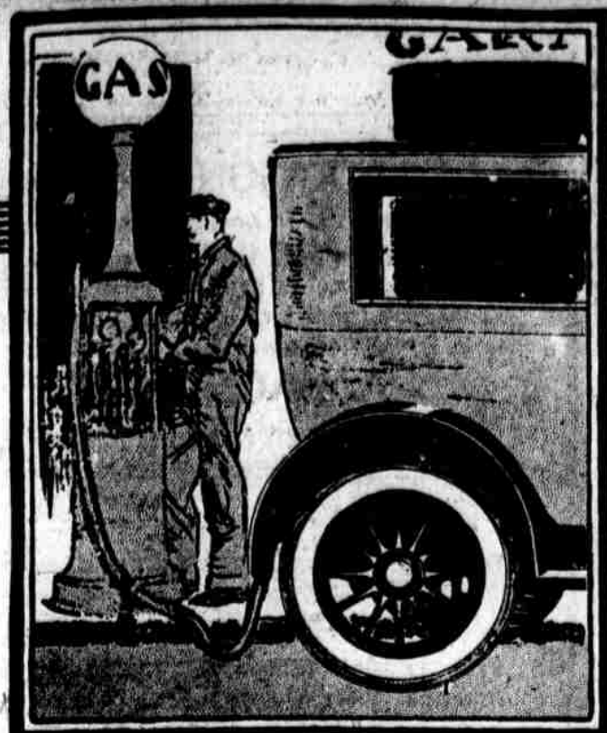
Do you get 20 miles to the gallon of gasoline?