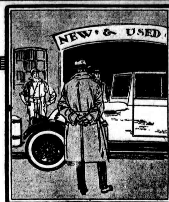
Does your car depreciate so slowly that it has a high resale value?