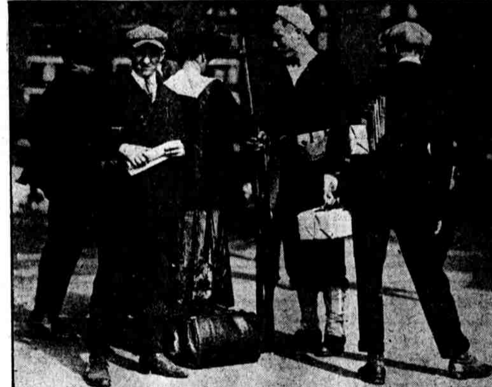
NEW YORK CUSTOM HOUSE GUARDED. United States coast guards assist the New York police as the result of anonymous warnings of another bomb outrage. All visitors must prove their identity before being allowed to approach the building.