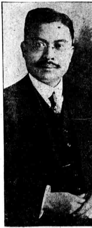
RAISED TO RANK OF BARON. Kijouro Shidehara, Japanese ambassador to the United States, receives notification of new honor conferred on him.