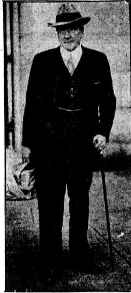
WANTS ALL HE CAN GET. James W. Gerard, chairman of the Democratic finance committee, admits that there is no limit to the money the Democrats want in the presidential fight.