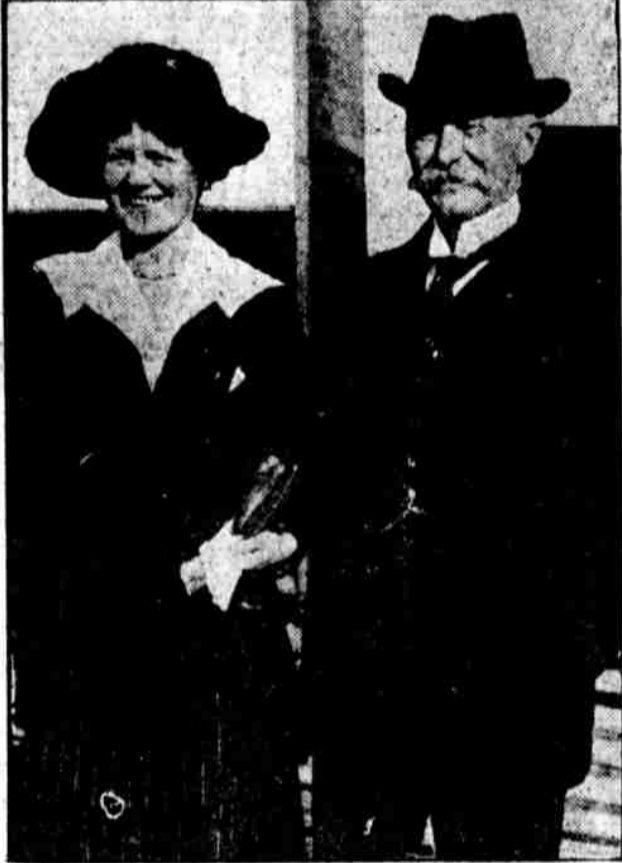
LORD AND LADY RATHOREEDAN. They have just arrived to represent England in the Massachusetts celebration of the tercentenary of the Pilgrims' landing. Both were heckled in New York by Irish women pickets.