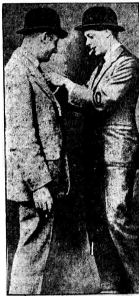
PRINCE OF WALES PLAYS JOKE. After his horse had lost in an Australian race, he pinned the ticket on an officer, pretending it to be a medal.