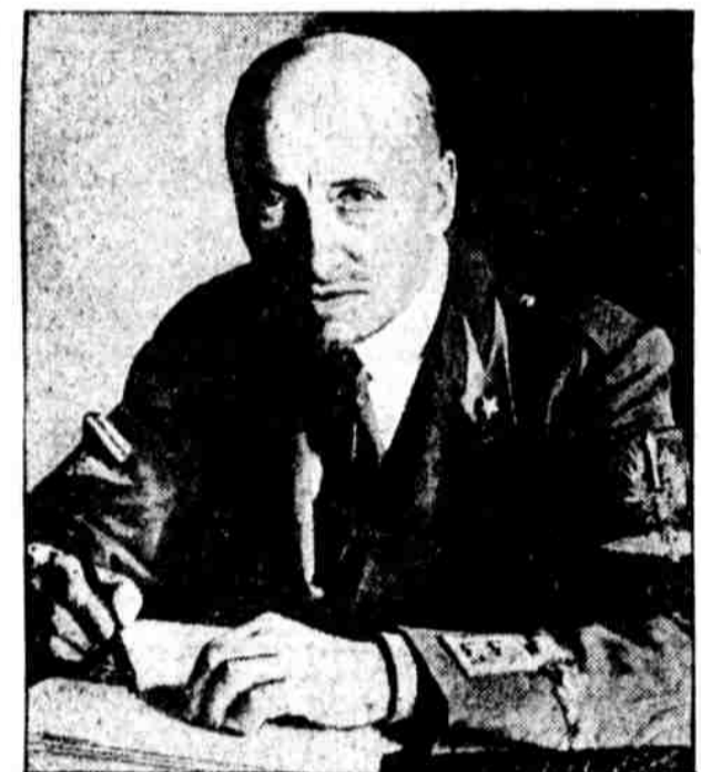
D'ANNUNZIO, THE GOVERNOR. Italy's poet-warrior in his full dress of governor of the city of Fiume, busy at his desk in that independent city.