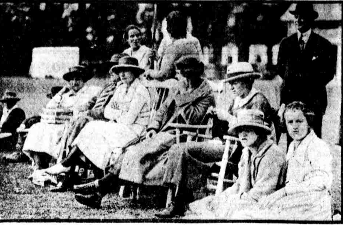
Philadelphia and visiting women tennis players yesterday continued to fight for tennis honors of Philadelphia The tournament is being played at the Germantown Cricket Club, Manhelm