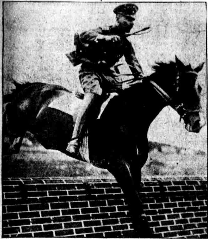
THE FIFTH SON OF THE EX-KAISER. Prince Oscar is the only one of the sons that still wears a uniform. He has long been considered a champion rider.