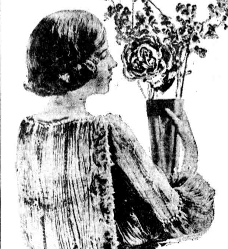
You would do well to have one of these attractive accordion-pleated blouses of indestructible voile. It isn't all pleated, but the lower part of the waist, the peplum, the fluffy part of the sleeve and the panel down the back make enough of a majority to justify this description. The panel is edged with moufflon and the tiny buttons are covered with silk

fangled ideas, can be good, he is forever sighing for "those good old times." And, no doubt, the old lady who solemnly declared that even "the moon used to shine more brightly when I was a little Without Being Able to Move girl" had hands and fingers which could