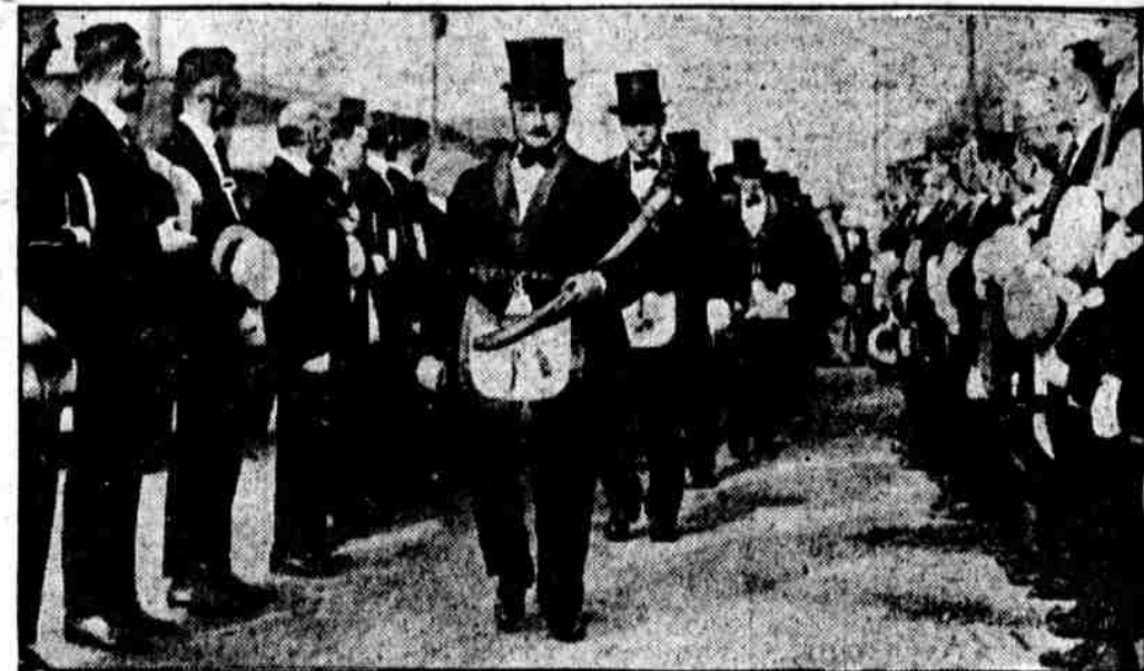
CORNERSTONE LAID BY STATE MASONS. Grand lodge officers join with Tacony Masons in laying the cornerstone of the Wissinoming Presbyterian Church.