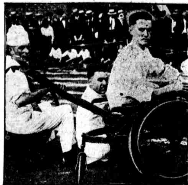
ENJOYING NAVY DAY. A group of sick sailors watch the events of the day at the Philadelphia Navy Yard from their wheel-chairs.