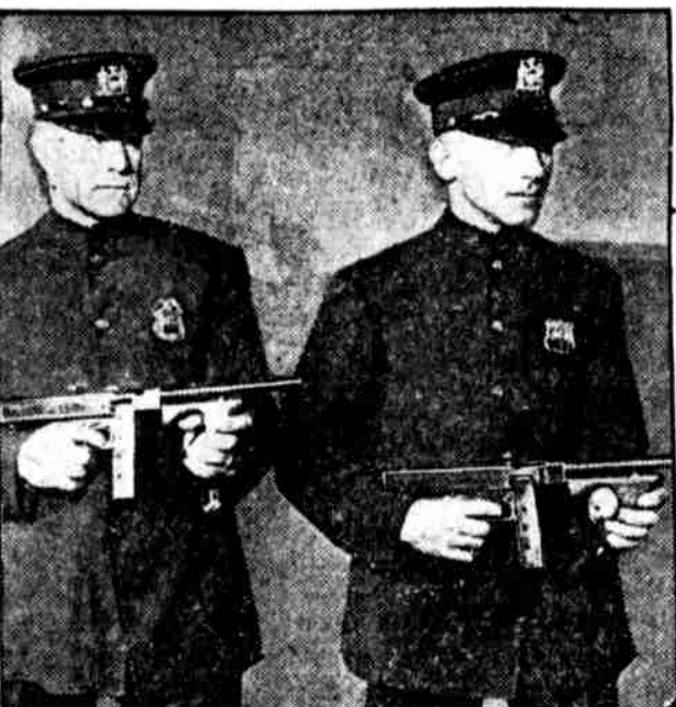
POLICE HAVE MACHINE GUNS. For use in riots and for chasing auto thieves, the New York police have been given machine guns. International.