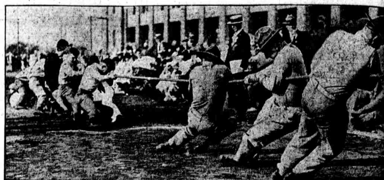
MARINES PULL HARDEST. The tug-of-war team representing the marines defeated the S. S. Columbia during the Navy Day events at the Philadelphia Navy Yard on Saturday.