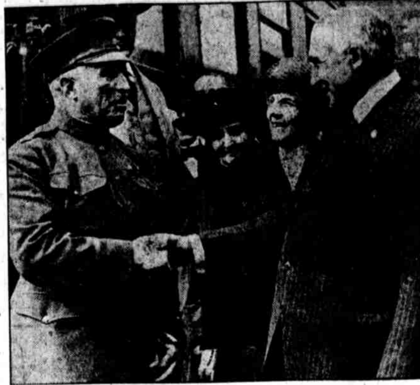
THEY MEET IN CHICAGO. Senator Harding stops off to talk things over with Major General Leonard Wood. Mrs. Harding is shown beside the senator