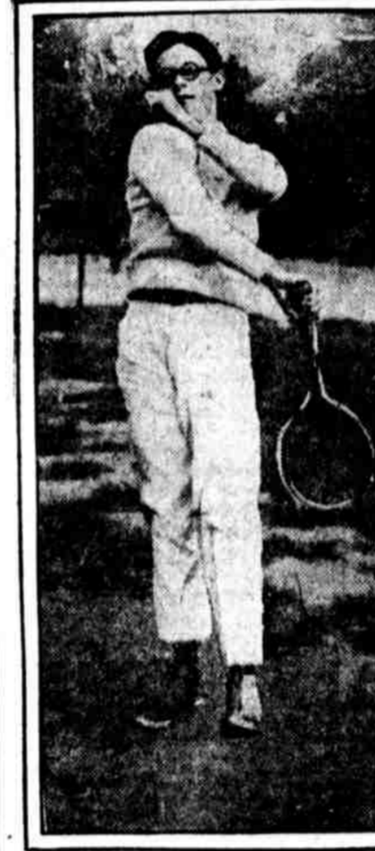
JUNIOR TENNIS CONTESTANTS. Lansdowne courts have seen many a fast game during the junior contests of the last few days. Among the players who have forged themselves through to the semifinals are