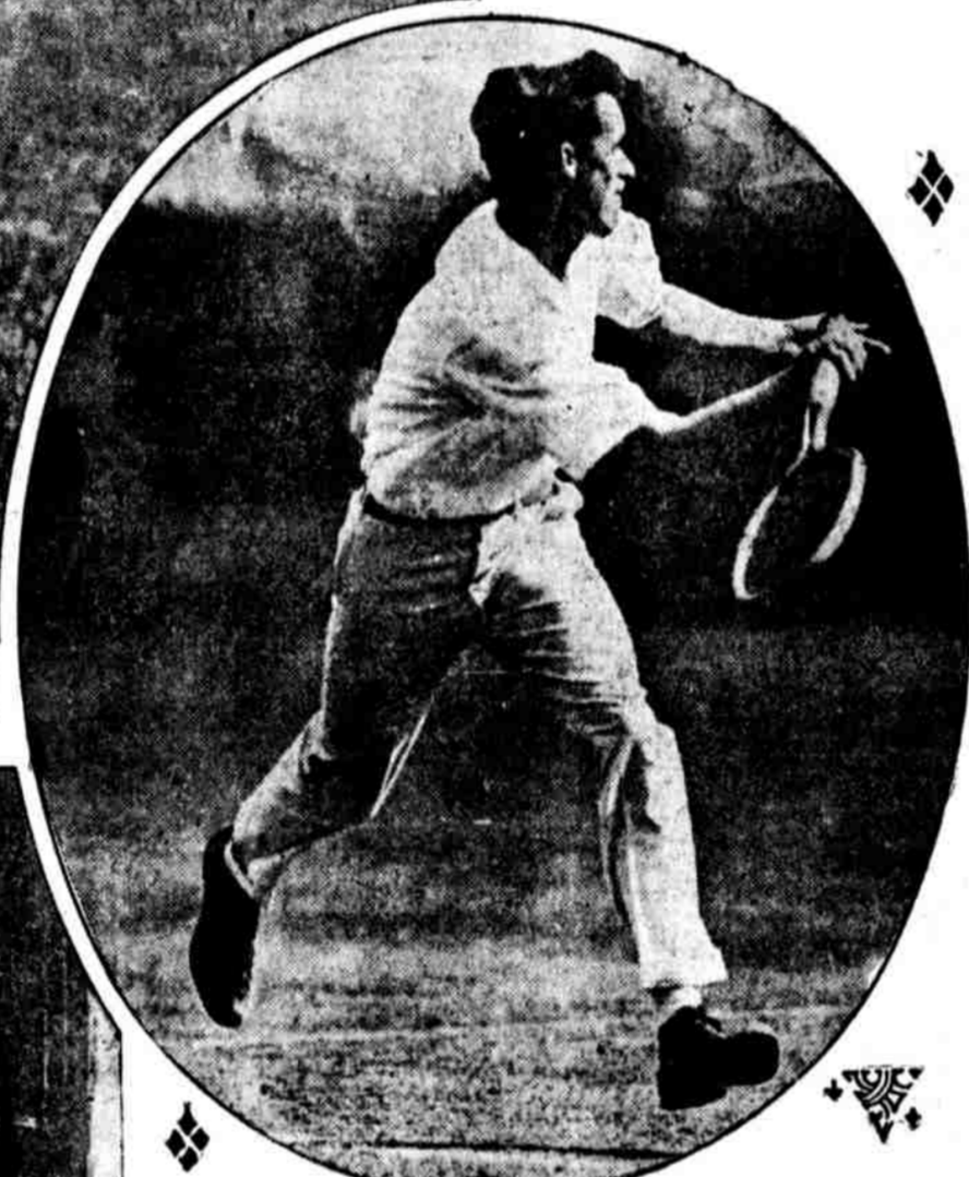
OUR NATIONAL CHAMPION. William Tilden snapped while winning national tennis championship. Tilden will be seen at Mannheim this afternoon in the East-West doubles