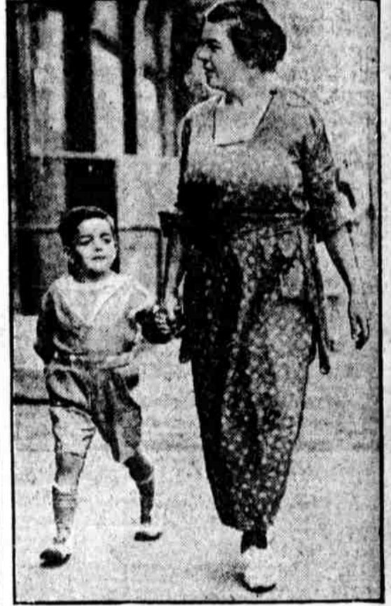
HIS FIRST SCHOOL DAY. A South Philadelphia mother taking her lad to the McCall School just before the opening session of the fall term yesterday