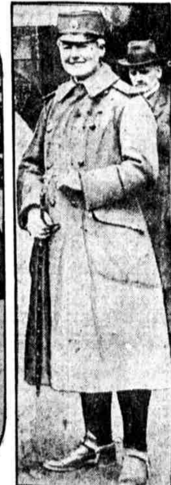
WOMAN GETS MILITARY DECORATIONS. Lieutenant Flora Sandes served as private in Serbian army until promotion came for bravery. She is now in Australia