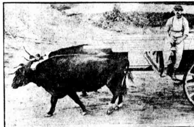
AT LEWES, DELAWARE. The oxen and cart still find a place in the lumber industry of the Delaware bay town