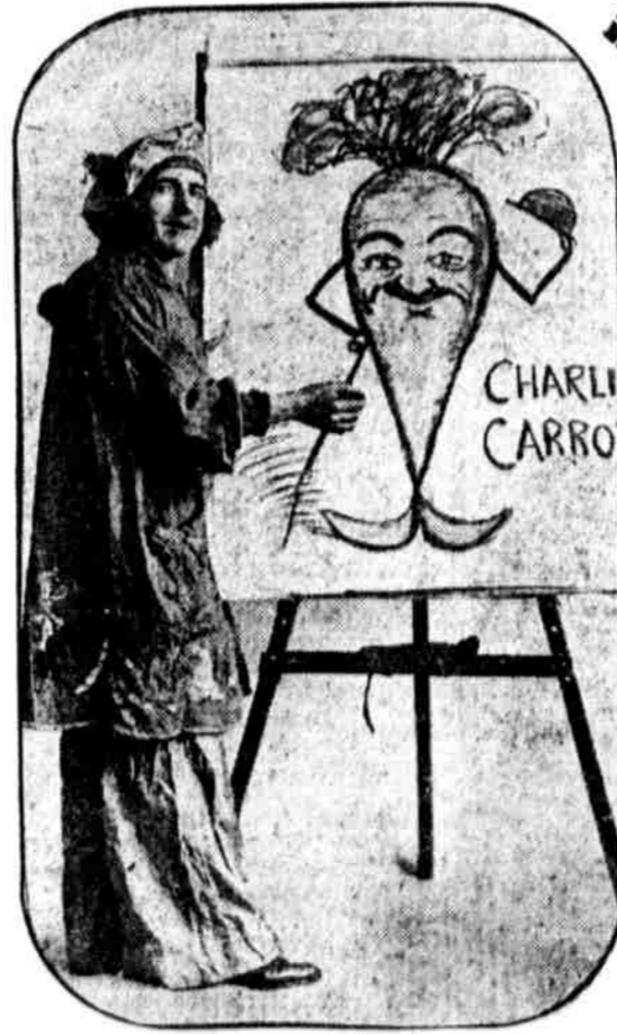
ILLUSTRATING HEALTH RULES. The Picture Man at the Byberry fair under the auspices of the Philadelphia Health Council by rapid cartoon work teaches simple rules of health