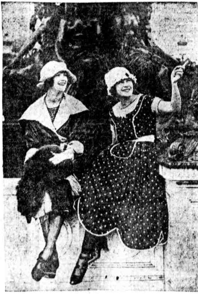
THEIR FIRST TRIP TO PARIS. Constance (left) and Norma Talmadge, American movie stars, sitting on the famous fountain at the Place de la Concorde.