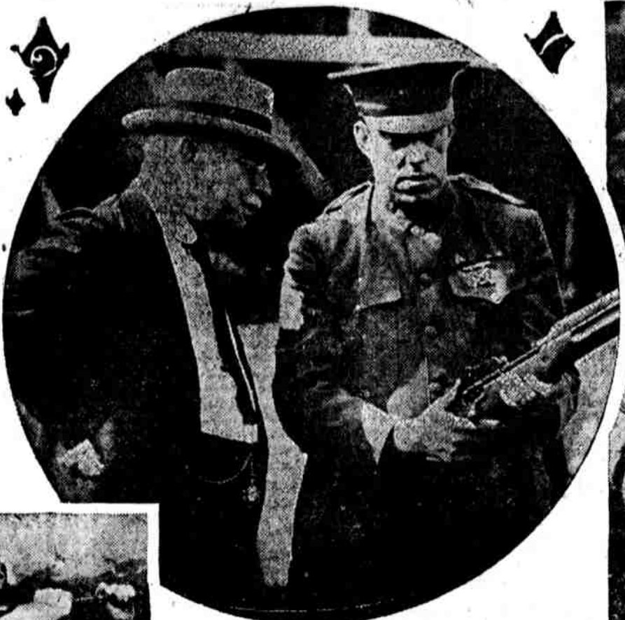
RECRUITING AT THE BYBERRY FAIR. U. S. Army recruiting forces are busy at Byberry during the annual Philadelphia County Fair. Much army equipment is being exhibited.