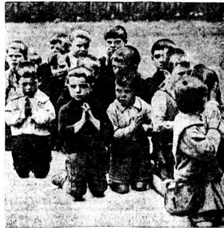
PRAY FOR MAYOR OF CORK. Little children gather in Dublin churchyard, where they pray for Terence MacSwiney, the Lord Mayor of Cork.