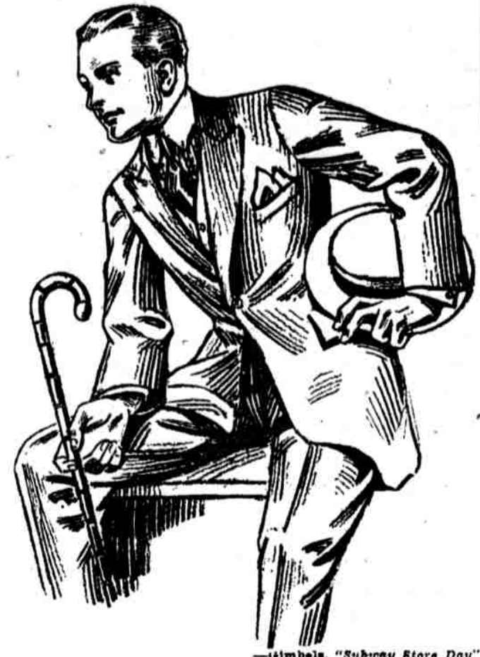
—Gimbels, "Subway Store Day"