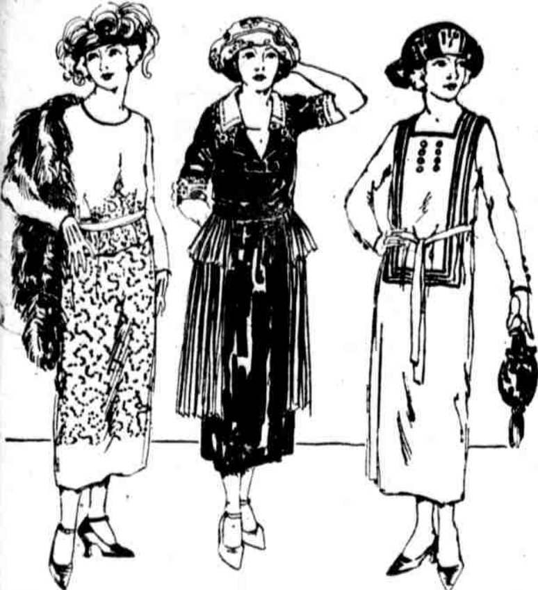
Wool Embroidered Tricotine—$14.75. Satin with pleated panels—$14.75. Braid-trimmed Tricotine—$14.75.

Mostly Tricotines and Satins—Some Serges—Some Charmeuses—and a Sprinkling of Georgettes and Taffetas. Fourteen Styles.