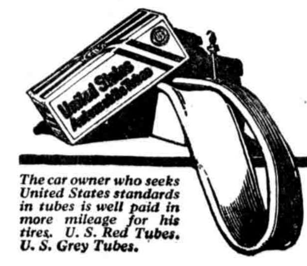
The car owner who seeks United States standards in tubes is well paid in more mileage for his tires. U. S. Red Tubes. U. S. Grey Tubes.

Going into the jungles of Sumatra and developing 100,000 acres of rubber lands, which include the