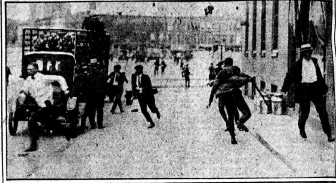
FIRST VIOLENCE IN BROOKLYN TROLLEY STRIKE. Police and plain clothes men are seen routing the remnant of a truckload of street-car workers.