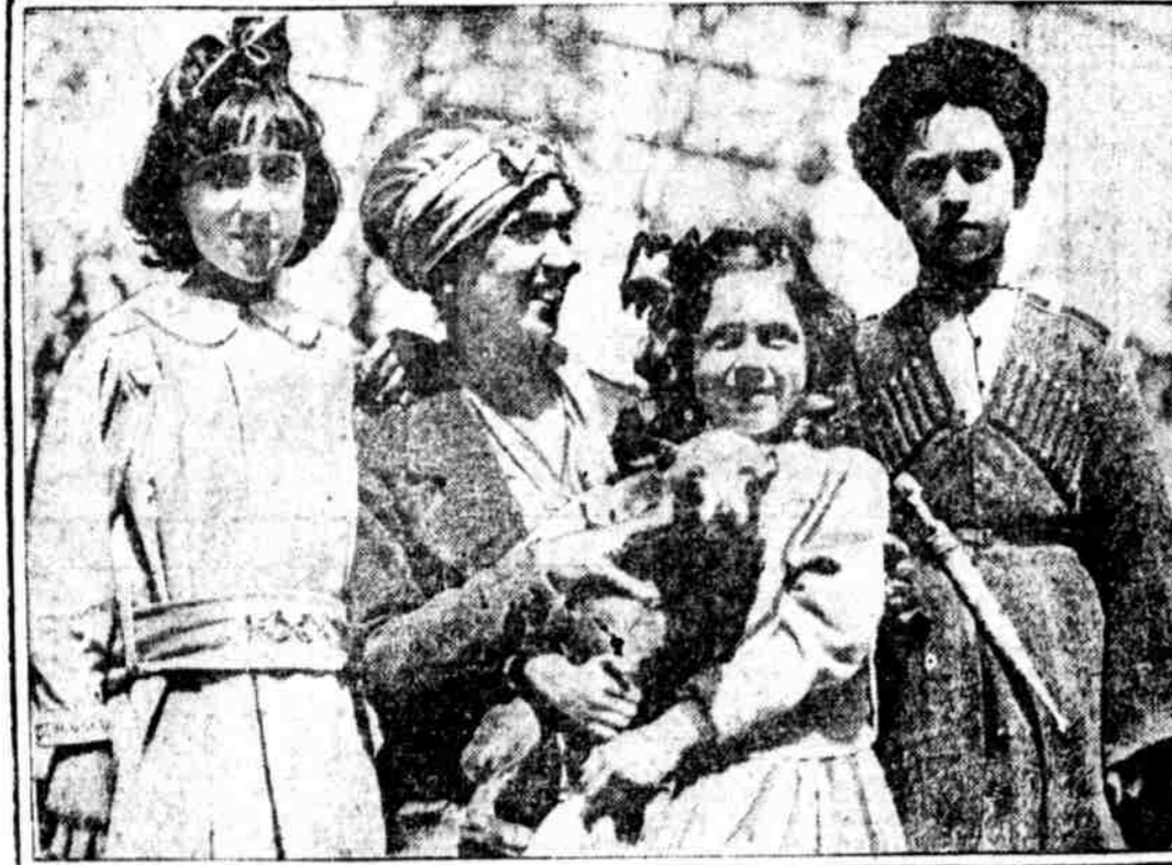
GENERAL WRANGLER'S WIFE AND CHILDREN. While her husband commands the armies protecting Crimea against the Soviet hordes, Mrs. Wrangel is assisting the American Red Cross in caring for refugees.