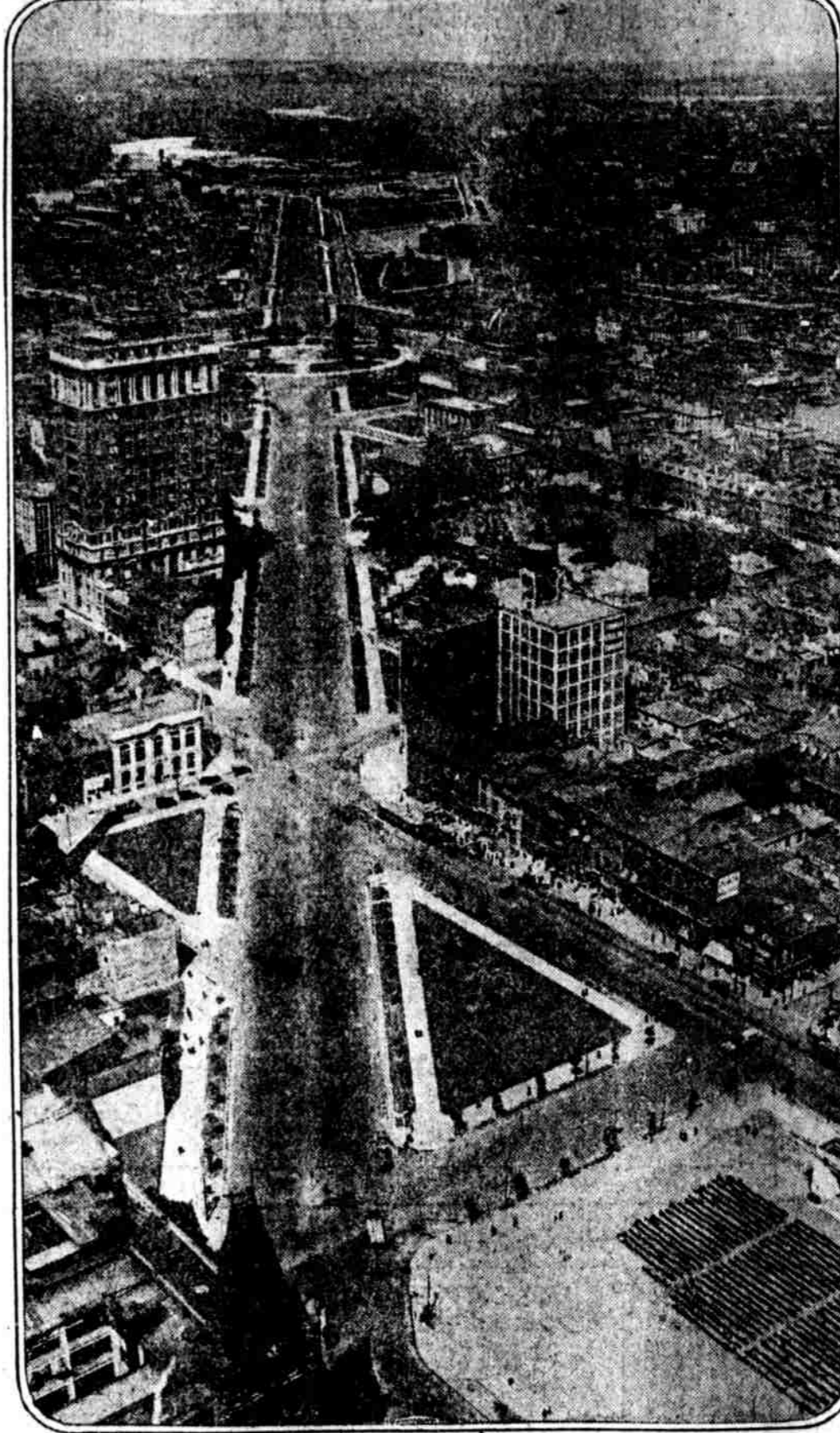
LOOKING FROM CITY HALL TOWER. Month by month the Parkway improves in beauty and usefulness to the city. The latest improvement is the band concert pavilion and seats at the lower part of the photograph. In the upper part of photograph is the Schuylkill river and Fairmount Park, the Parkway leading to the Green street entrance. Where the Parkway circles about Logan Square is clearly shown.