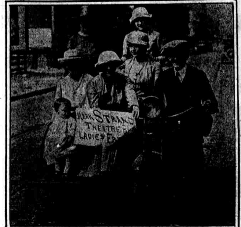
BEATING THE BROOKLYN STRIKE. Six passengers on a motorcycle bus. A line has started since the Brooklyn street car strike opened to carry folks from Brooklyn to New York and return.