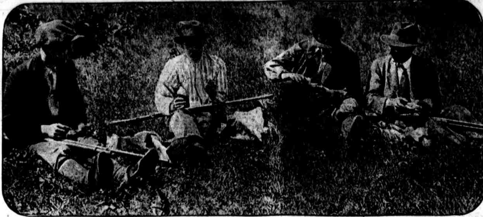
TIME FOR LUNCH. The reedbird season of Pennsylvania opened yesterday, bringing out thousands of hunters who have been resting throughout the summer. At Essington reedbirds were plentiful