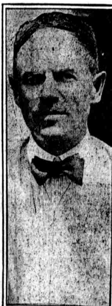
LOOKING AFTER PENN'S FOOTBALLERS. John Heisman, Penn's football coach, at George School, Newtown