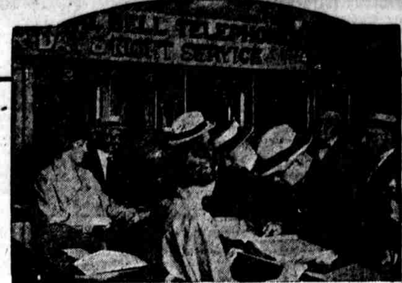
Public Telephones at the Reading Terminal where two thousand calls are made daily.

How many times a day do you imagine the telephone directory is consulted?