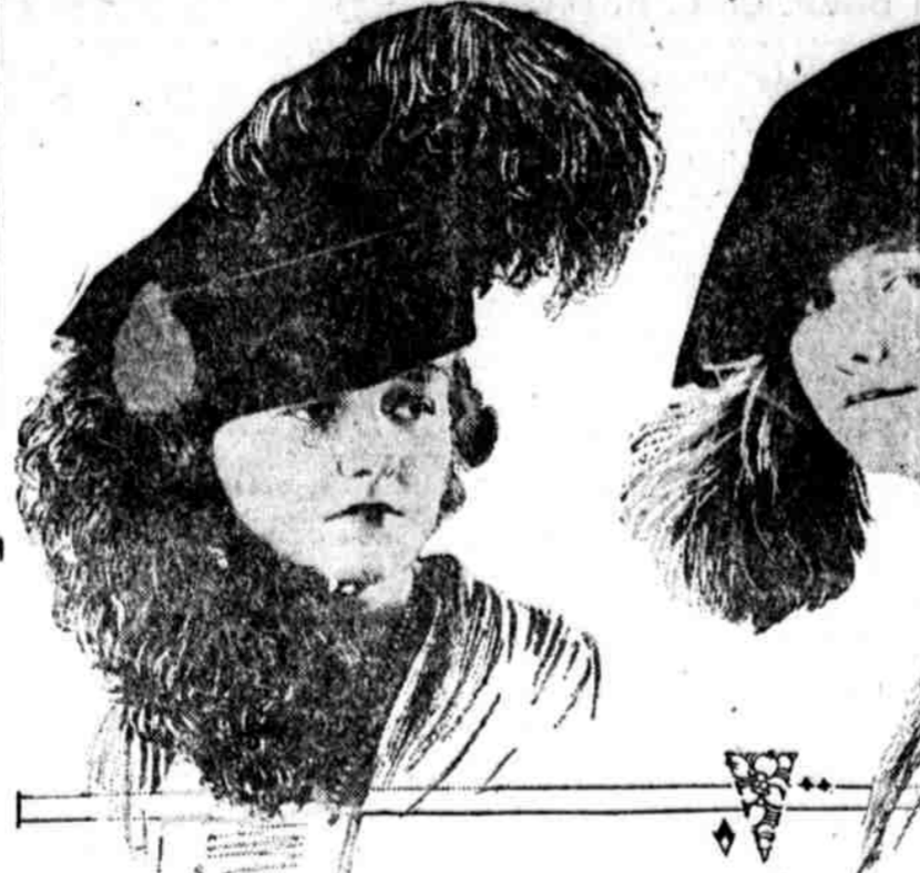
The ostrich feather has come to its own for the fall season at least. Curled or uncured, tufted or in tips, long and willowy, as you will; but if you haven't a hat with ostrich in some form, your wardrobe will not be quite complete.