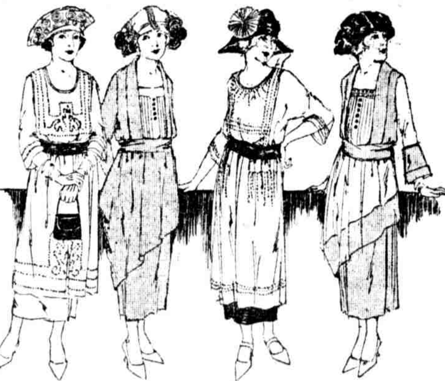
Beaded Georgette $15 Satin $15 Beaded Georgette and Satin—$15 Georgette & Satin $15