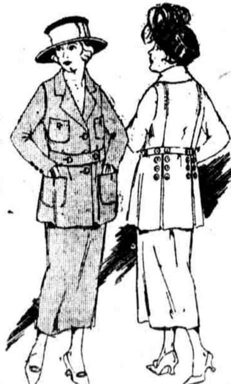
Jersey $18 Cheviot $18

Mostly Georgette—and most navy blue. But lustrous satins, too. And crisp, new taffetas. And Georgettes in combination with satin. Beaded styles—and braided styles. And some mighty clever treatments with buttons. Misses' sizes, 14 to 20; Women's sizes, 36 to 44. —Gimbel's, "Subway Store Day"