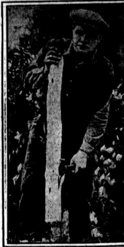
FOUND SOME GOOD BAT MATERIAL. Babe Ruth cuts down a tree, trims the stick a bit and then sends it to a factory for turning and finishing.