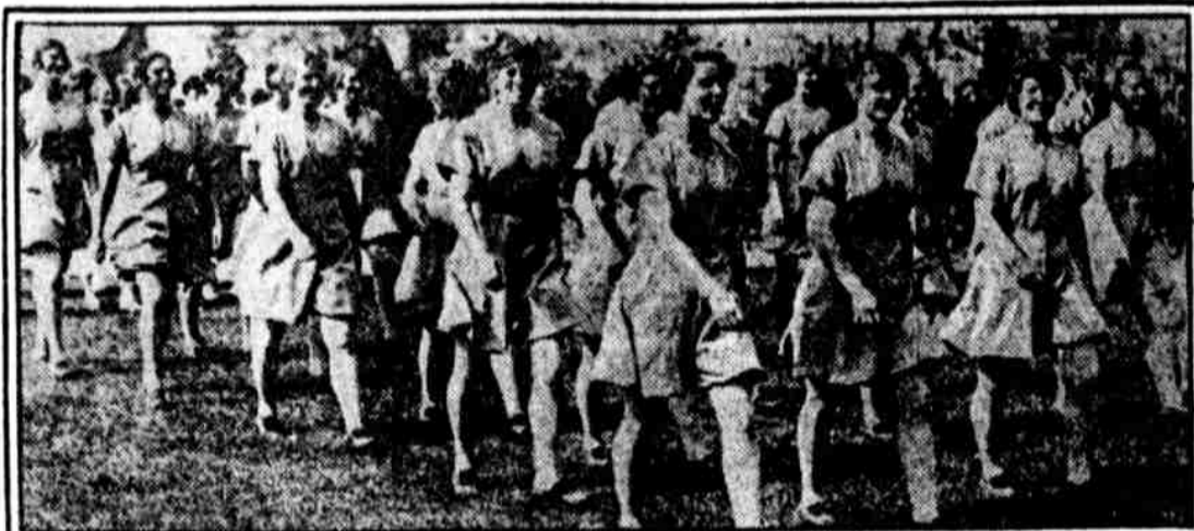
SWEDISH GIRL ATHLETES entering the Stadium at Antwerp for the Olympic games. Sweden had more women competing than any of the other countries.