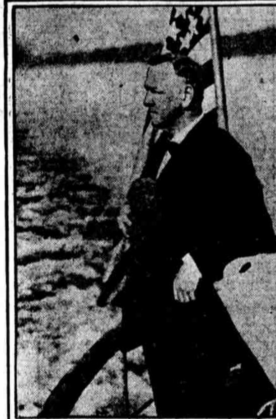
HOME FROM ALASKA. Secretary of the Navy Daniels sees a strip of the mainland as he returns from his trip to Alaska.