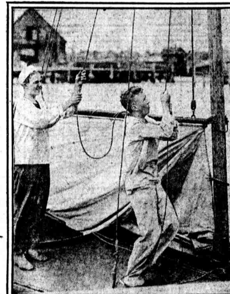
PRINCETON TRACKMEN ENJOY YACHTING. A group of the university students are summering together at Bay Head, N. J.