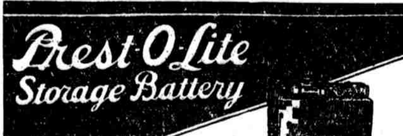
Coolbaugh-Macklin Motor Co. 3725 Walnut St. Preston 3504