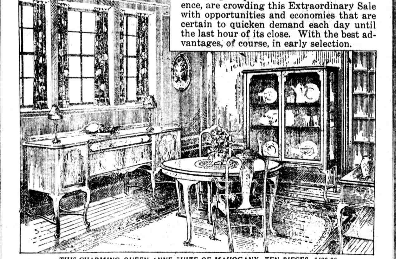
THIS CHARMING QUEEN ANNE SUITE OF MAHOGANY, TEN PIECES, $480.00. The Queen Anne Period, to which the designer had recourse in producing this handsome Dining Room Suite, has resulted in the creation of an exceedingly graceful and charming group.