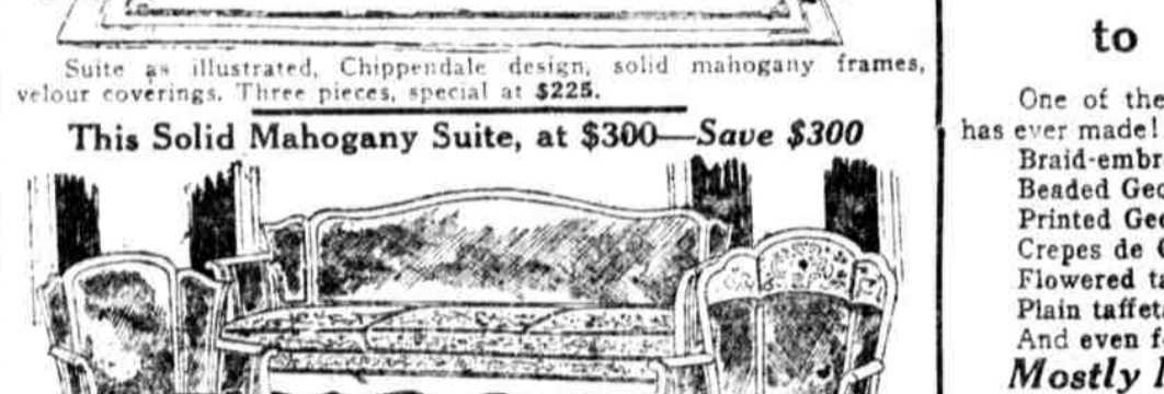
This Solid Mahogany Suite, at $300—Save $300. Beautiful Queen Anne suite, as illustrated, solid mahogany frames, cane panels, velour coverings. Three pieces, special at $300.