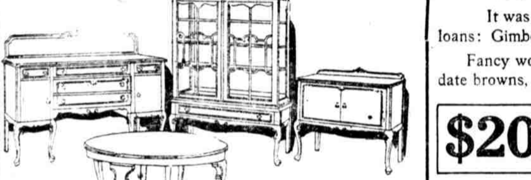
This Queen Anne Suite, at $300. Save $300. Suite as illustrated, American walnut, 66-inch buffet, 54-inch top extension table, large china closet and serving table. Four pieces, special at $300.