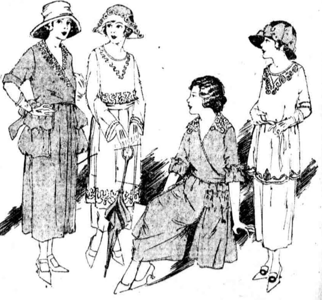
Satin, $13 | Georgette, $13 | Taffeta, $13 | Tricolette, $13

About a thousand all-told. Voiles with organdie pleatings—mighty dainty! Organdies—crisp and lovely. Plain voiles. Printed voiles. Plaid Gingham combined with plaid voiles. Lincen Dresses—in coat-dress styles. Check voiles. Scroll-pattern voiles. Plenty of white—plenty of pink—plenty of rose-color—plenty of blue; besides those lovely, lovely color-printings and plaidings! Misses' sizes 14 to 20. Women's 36 to 44.—Gimbels, Subway Store