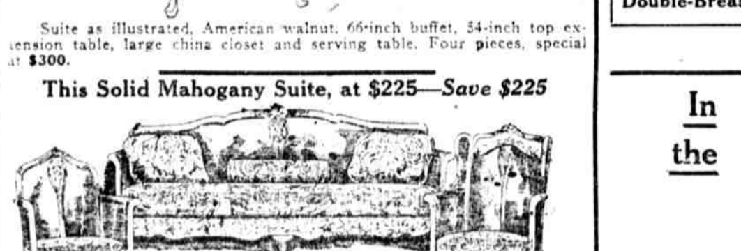
This Solid Mahogany Suite, at $225—Save $225. Suite as illustrated, Chippendale design, solid mahogany frames, velour coverings. Three pieces, special at $225.