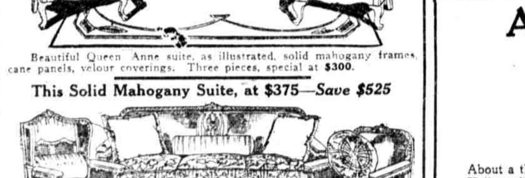
This Solid Mahogany Suite, at $375—Save $525. Suite as illustrated, Renaissance motif, solid mahogany frames, damask coverings, complete with pillows and bolster. Three pieces, special at $375.