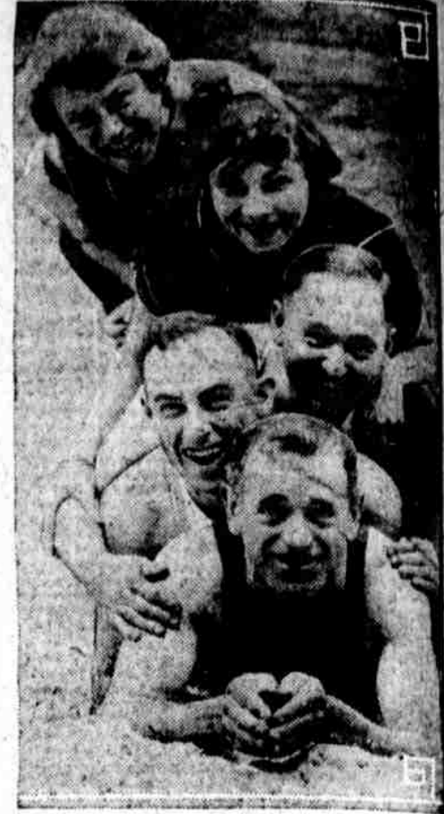
A CHEERFUL QUINTET. This happy group of bathers were having a merry time on the sands of Atlantic City, when our photographer asked them to pose.