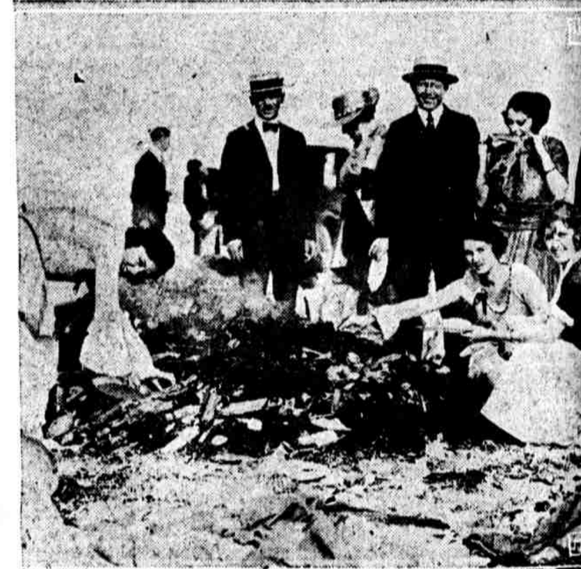
CLAMS AND CORN AND POTATOES. All roasted in the one big fire at Strathmere, N. J., by a group of picnickers. It's a real way to eat them—right out of the fire.