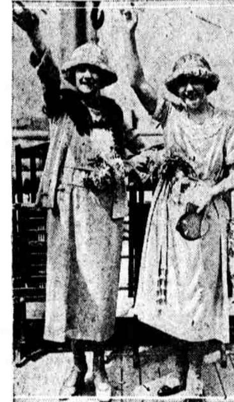
TWO SCREEN STARS SAIL AWAY. Constance and Norma Talmadge, who sailed for a European trip with other movie folks.