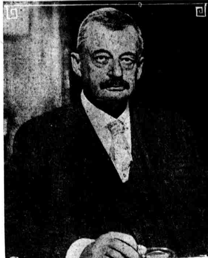
SENATOR PENROSE CONTINUES TO IMPROVE. This photograph was taken yesterday afternoon at his home, 1331 Spruce street, just as he returned from an automobile tour of Fairmount Park.