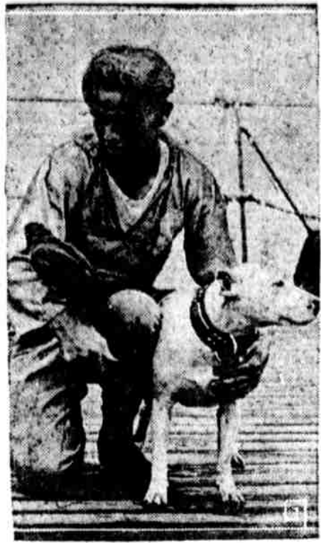
MASCOTS ON GERMAN WARSHIPS, brought from Scapa Flow. The ships arrived in New York a few days ago. The goat, the dog and the parrot were only a few of the many mascots.