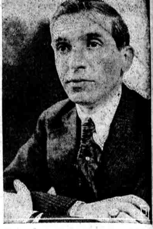
BOSTON'S "WIZARD" OF FINANCE ARRESTED. Charles Ponzi, whose ability to "amass" millions amazed the world, is held on several charges.