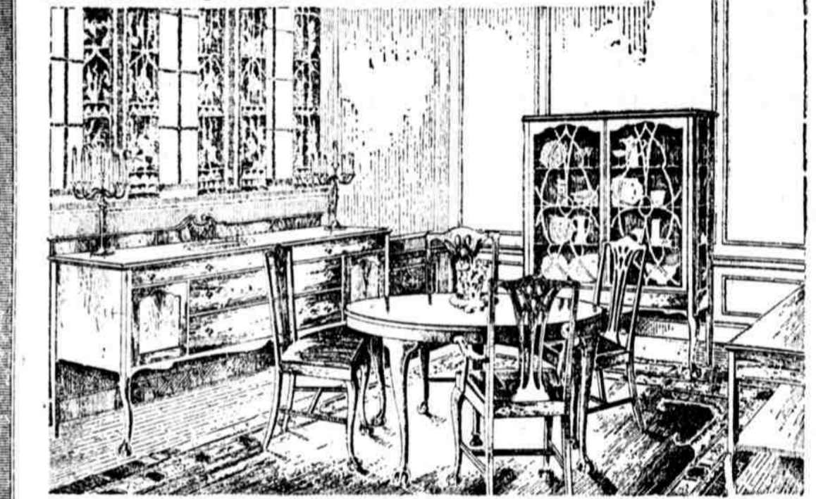
THIS UNUSUALLY FINE CHIPPENDALE SUITE, OF MAHOGANY, 4 PIECES, $365.00 The handsome Chippendale Suite illustrated embodies the beautiful lines that characterize this charming style, generally employed in the production of the most elaborate and expensive Furniture. In fashioning the Suite, the designer has happily retained the proper degree of elegance without employing too much elaborate detail, thus imparting to the whole a grace and dignity that eminently fits it for the modern dining room. The workmanship is of the most careful character, with a fidelity to the artistic principles of cabinet making rarely equaled in Suites of this class. Buffet 60x32 inches; Table 48 inches in diameter, 4 ft. extension. Serving Table 40x18 inches, and large China Closet.

Equally important are the economies of our tremendous purchases, bought in great part when costs were lower than now; our enormous storage space, the output of our own enlarged factory, which goes first cost to you, and our prominent and inexpensive location that in itself saves our customers $250,000 a year. And back of each purchase the Van Sciver guarantee of quality, with the service of courteous and expert salesmen who know, and can advise you on decorative harmonies, as well as all housefurnishing needs, from kitchen to attic.