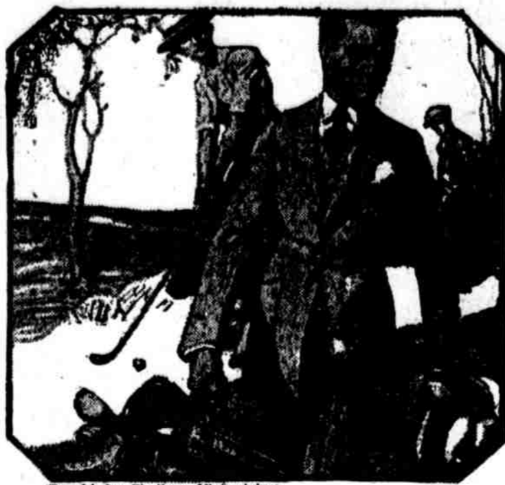
Illustration by The House of Kuppenheimer