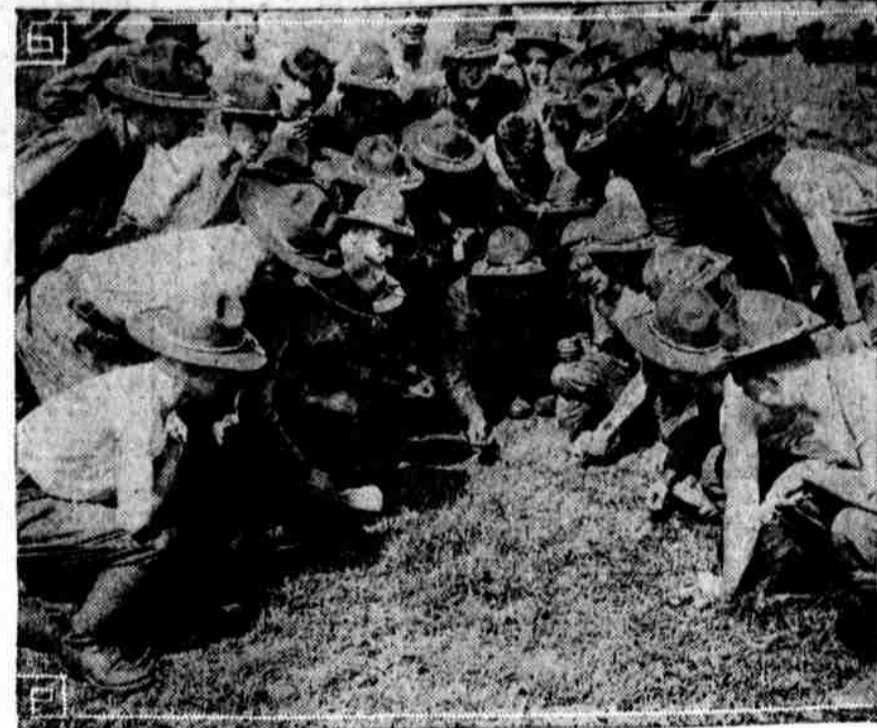
SOME KIND OF GAME. It was a very few minutes after the streets were lined with tents that the games started