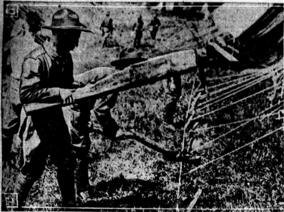
DRIVING STAKES. Philadelphia guardsmen using large sticks as mallets in getting their street in order