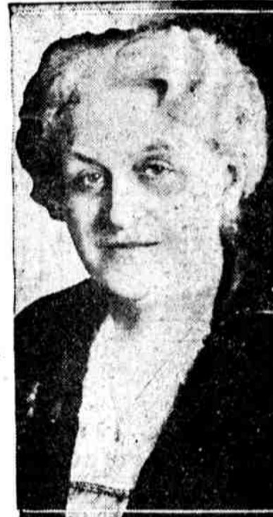
Mrs. Carrie Chapman Catt has been busy at Nashville for some time