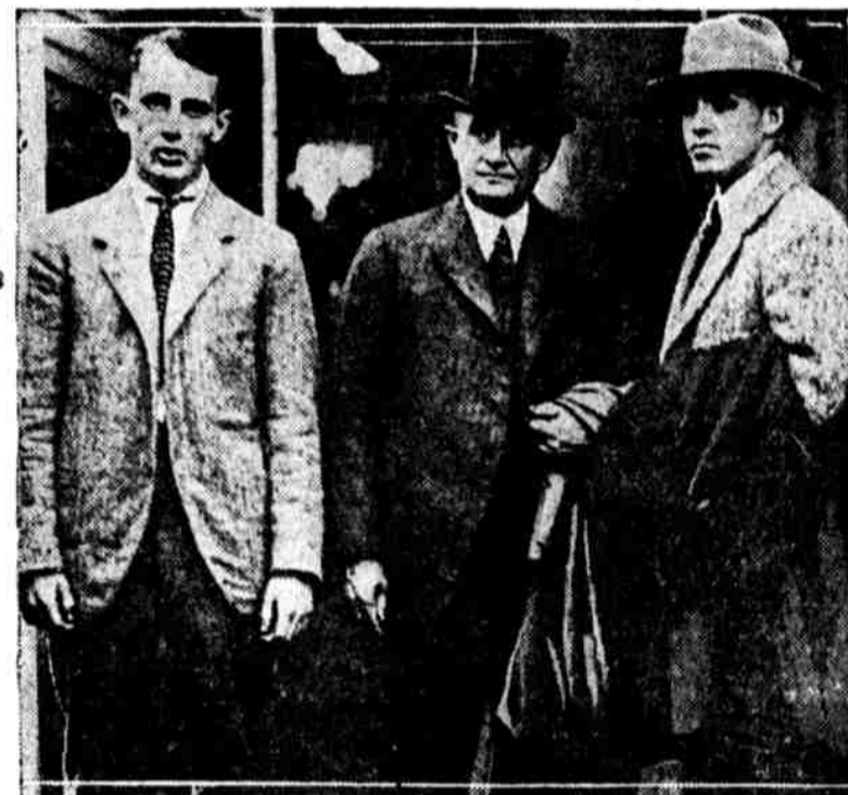
DR. MAYO AND SONS. Dr. Charles H. Mayo, of Rochester, Minn., and his two sons have just returned from a trip in Europe, where the doctor noted surgical conditions and appliances