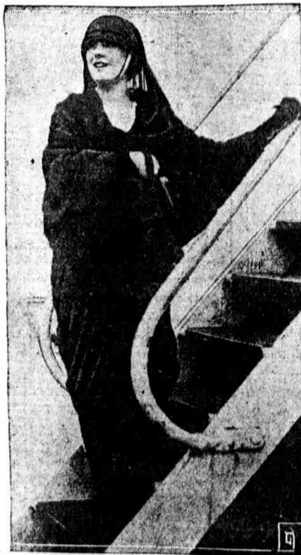
RETURNS FROM PARIS TRIP. Marilyn Miller Carter, the actress, aboard the S. S. Adriatic, as she arrived in New York