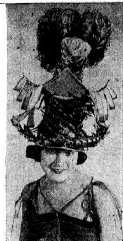
A BIRD HAT. It was one of the most striking exhibited at the Milliners' Association Convention in New York