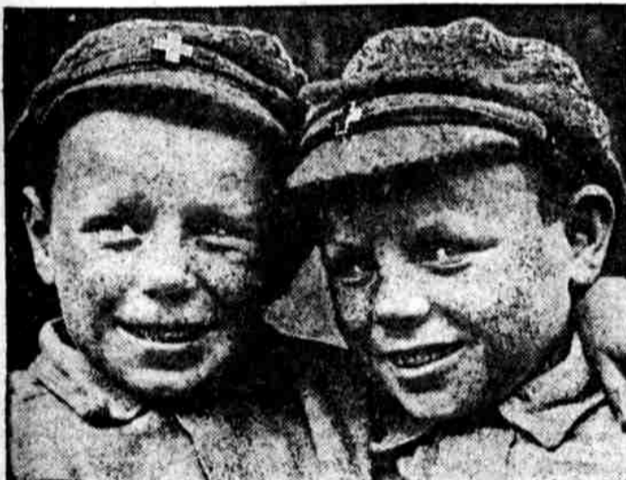
GOING BACK HOME. Two Russian lads in San Francisco, being transported to their homes, from which they were torn by internal Russian wars