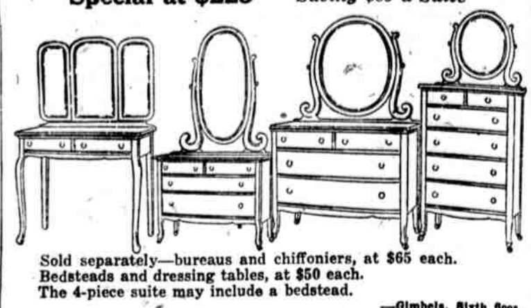
Sold separately—bureaus and chiffoniers, at $65 each. Bedsteads and dressing tables, at $50 each. The 4-piece suite may include a bedstead. —Gimbels, Sixth floor.

Five Hundred Pieces of Chamber Furniture At One-Fourth to One-Third Savings These Pieces Are Made in Mahogany, Oak and Natural Curly Birch Four-Piece-Suite in any of the Woods Special at $225 Saving $85 a Suite