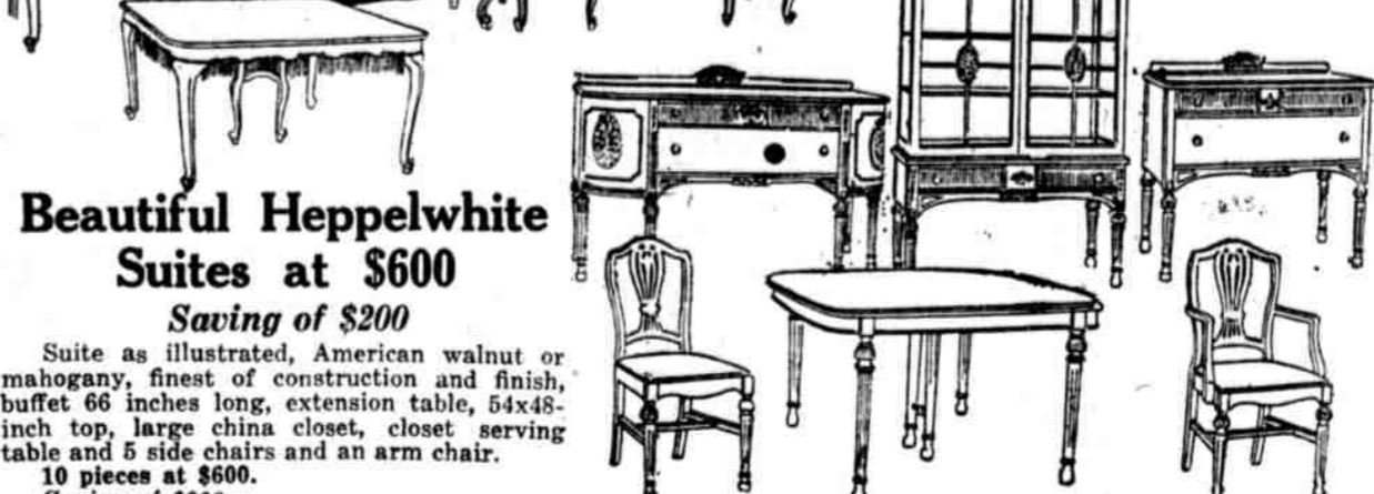
Beautiful Heppelwhite Suites at $600 Saving of $200 Suite as illustrated, American walnut or mahogany, finest of construction and finish, buffet 66 inches long, extension table, 54x48-inch top, large china closet, closed serving table and 5 side chairs and an arm chair. 10 pieces at $600. Saving of $200.

Louis XV Suites—Four Pieces at $475 Saving of $175 Suite as illustrated, American walnut or mahogany, 66-inch buffet, 54-inch top extension table, china closet, closed serving table. Four pieces at $475. Buffet fitted with mirror back, at $500. Saving of $175.