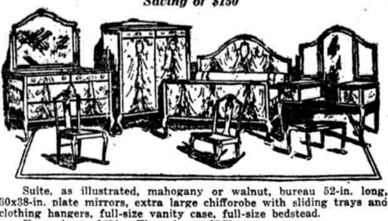
Queen Anne Suite, Four Pieces at $450 Saving of $150

Gimbel "De Luxe" Chamber Suites At Savings of $100 to $150. Suites in Four Designs, in Mahogany or Walnut. No Known Method of Furniture Construction has been Omitted in the Making and Finishing of These Suites. They are Shown the "GIMBEL WAY," Unfinished Wood Exposed—All Details of Construction Open for Your View and Explanation.