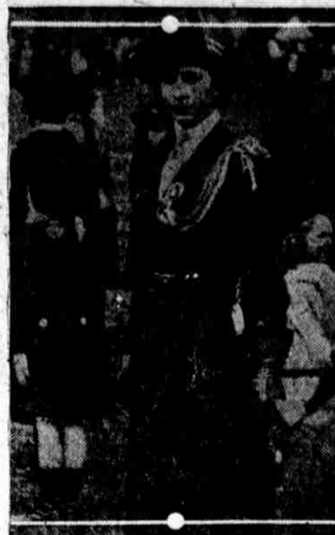
VISITING AT EDINBURGH. Princess Mary of England in the Scottish city during Girl Guides' celebration