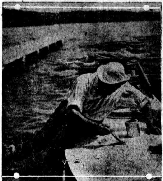
PAINIS AS WELL AS SINGS. Enrico Caruso, the famous tenor, giving his boat a coat of white, near his summer home, Easthampton, Long Island