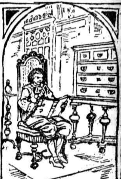
William & Mary