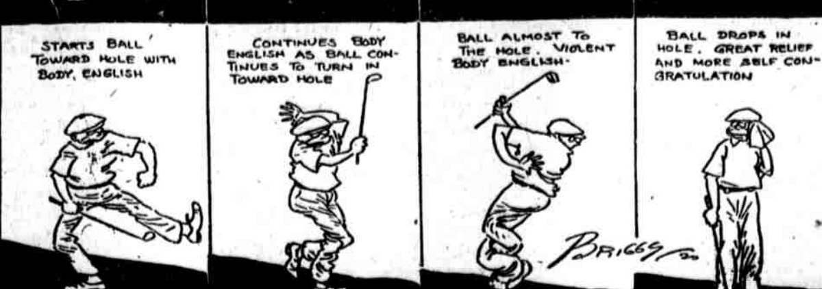
STARTS BALL TOWARD HOLE WITH BODY ENGLISH. CONTINUES BALL COMING TO TURN IN TOWARD HOLE. BALL ALMOST TO HOLE. VIOLENT BODY ENGLISH. BALL GREAT RELIEF AND MORE SELF COMGRATULATION.