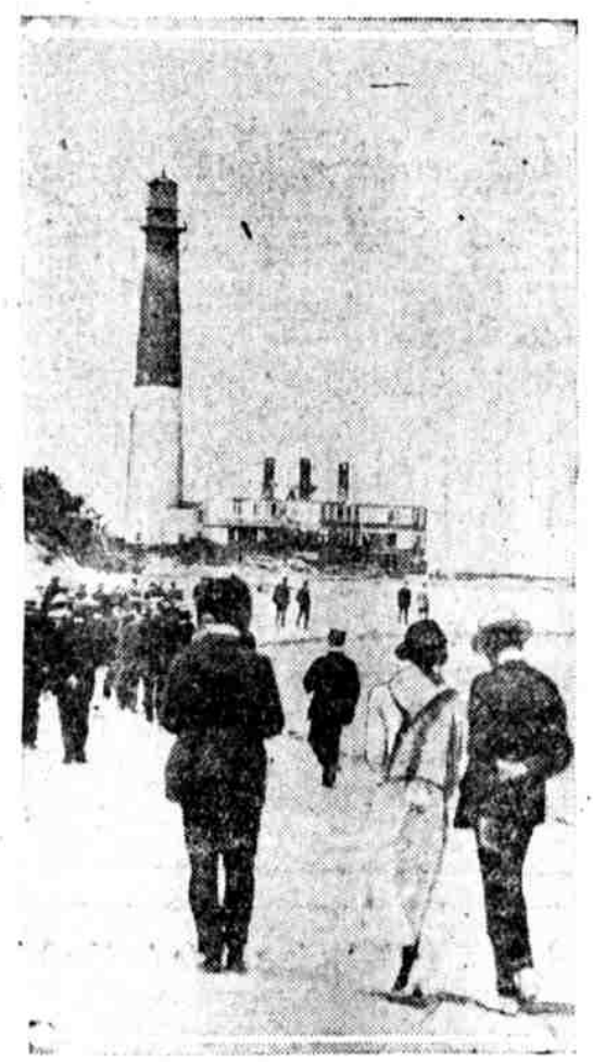
STILL MAKING EFFORTS TO SAVE BARNEGAT LIGHT. United States officials and New Jersey citizens touring beach prior to hearing held at Barnegat City