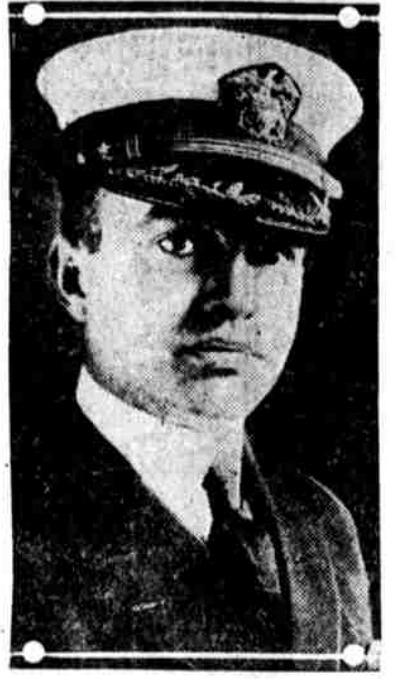
IN CHARGE OF UNITED STATES NAVY AND MARINE CORPS men in Olympic games. He is Commander Claude B. Mayo