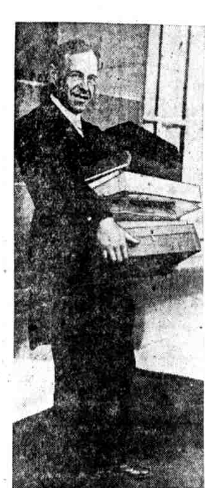
CARRYING THE ALLIED PEACE TREATY WITH AUSTRIA. An under secretary posed at the Palais d'Orsay, Paris