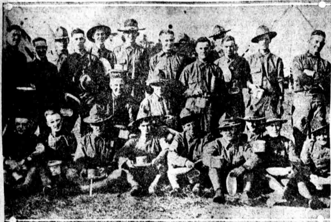
CAMDEN SOLDIERY. Members of the Third Regiment headquarters company and band, of Camden, waiting for the chow line to form.