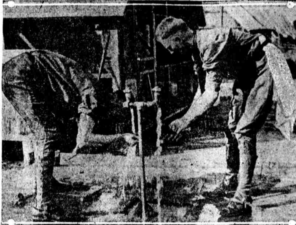
WASHING UP. Two cooks get ready to serve the evening oats to the rank and file. Running water and everything at this camp.