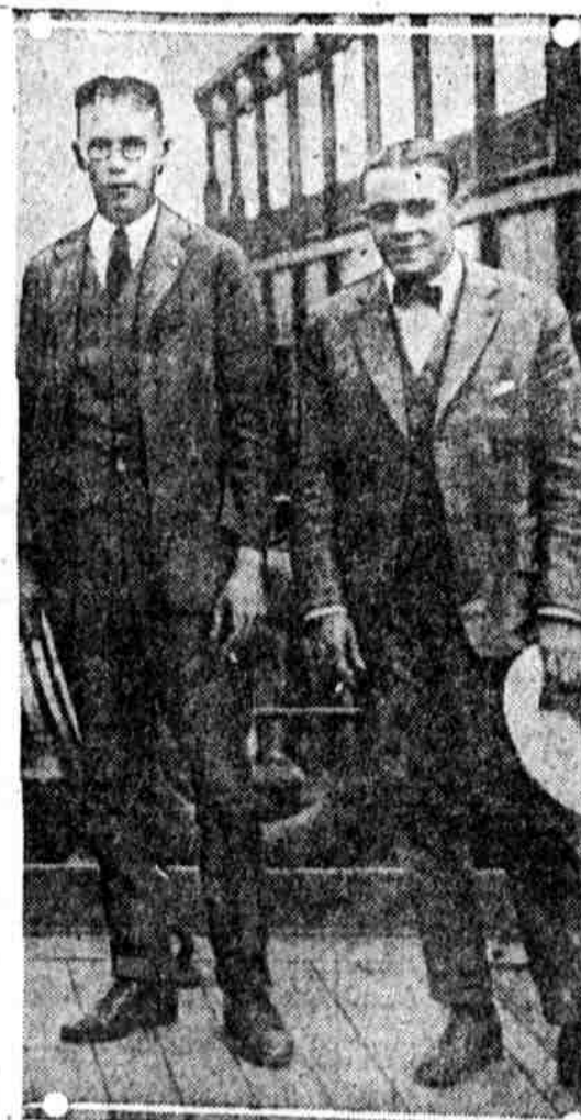
See caption for American Athletes Depart for Antwerp.