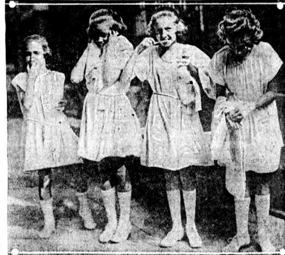
See caption for South Philadelphia Foreign Children in Health Playlet.