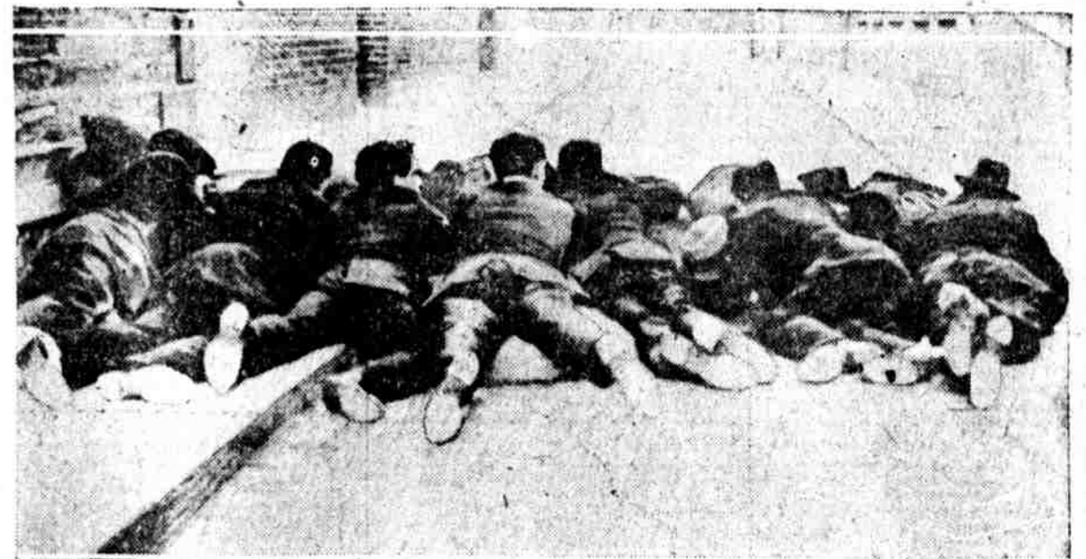
RIOT SCENE IN BELFAST. A group of Unionist guardsmen are shown lying behind sandbags from where they are guarding city approaches. A number of persons have been killed in this section during the last week.