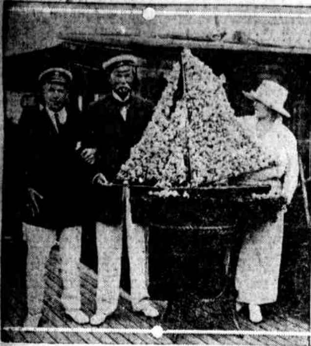
MODEL YACHT OF 1313 ROSES. It was presented to Sir Thomas Lipton by Commodore Stuart Blackton and his wife as a token of good luck. Sir Thomas Lipton and the donors are shown aboard the Victoria.