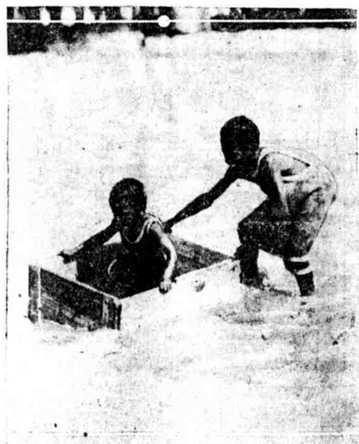
A LITTLE PUSH-BOAT. They were having a good time at the Inlet, Atlantic City. The lack of wind had no effect on their speed.