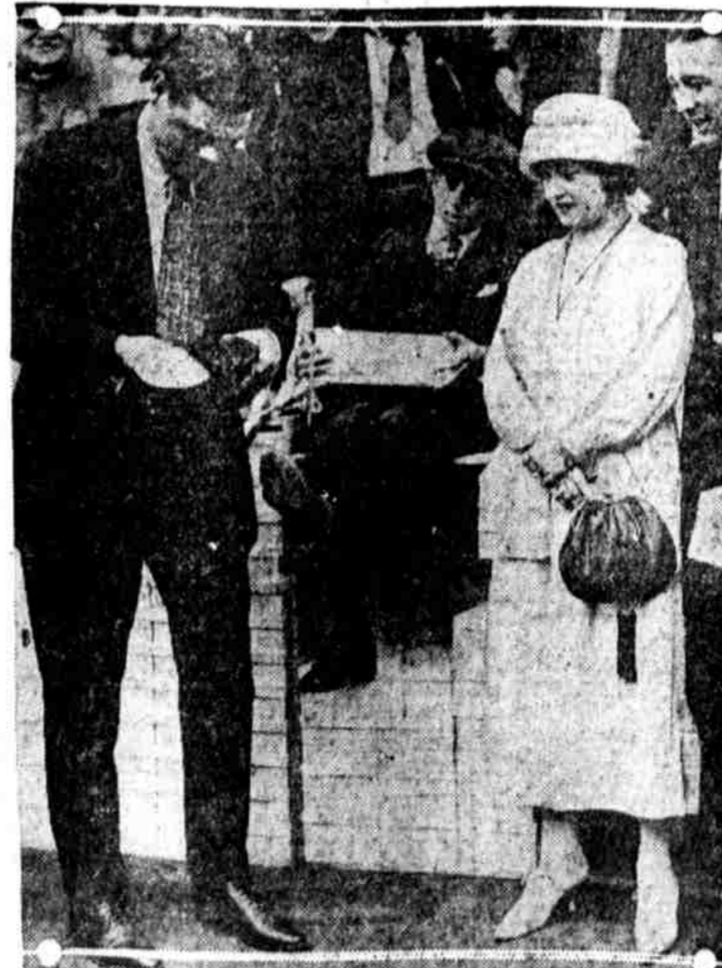
BABE RUTH GIVES HOME RUN SHOES TO ORPHANS. A New York firm presented the Yankee's home-run king with a pair of shoes for each of the home runs he registered. In turn he passed them to worthy children. Another pair is due for the thirty-third home run of yesterday.