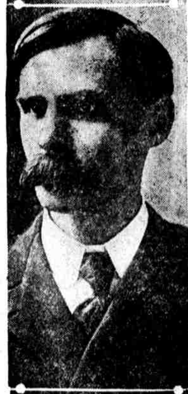
RIVAL DISQUALIFIED by Minnesota courts. Congressman A. J. Volstead, author of prohibition enforcement act, is again candidate for Congress.