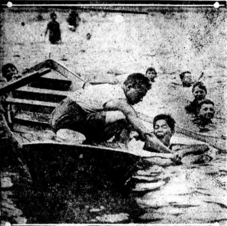
SOME SWIMMING. The boys are taught to swim and every effort is made to make each boy scout a life saver. The Delaware is not too deep at Treasure Island.