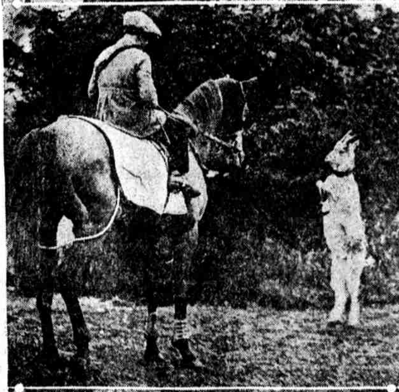
GOAT AT ATTENTION. The goat seems to recognize the wonderful Tehatras, one of England's best horses. The photograph was taken at a recent race meet.