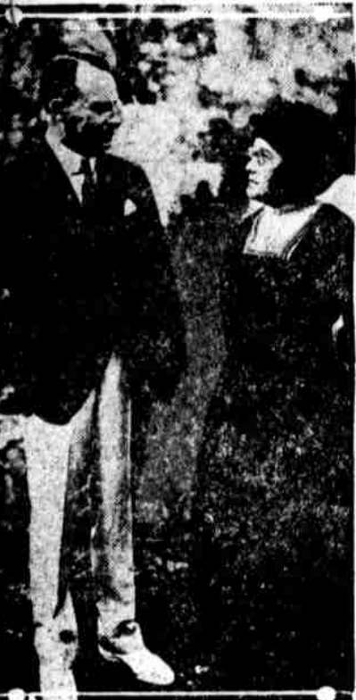
TALKING POLITICS. Governor Cox meets Mrs. Helen Hamilton Gardner, first civil service commissioner, during his Washington visit.

HUNDREDS OF BOYS ARE HAVING A GOOD TIME ON TREASURE ISLAND, THE SUMMER HOME OF PHILADELPHIA BOY SCOUTS.