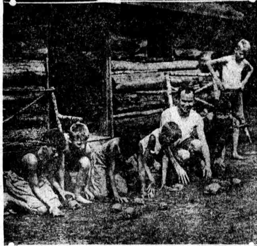
A TURTLE RACE. Boy Scouts put on a novel race in front of one of the cabins on Treasure Island, where the boys say there are as many turtles as Boy Scouts.