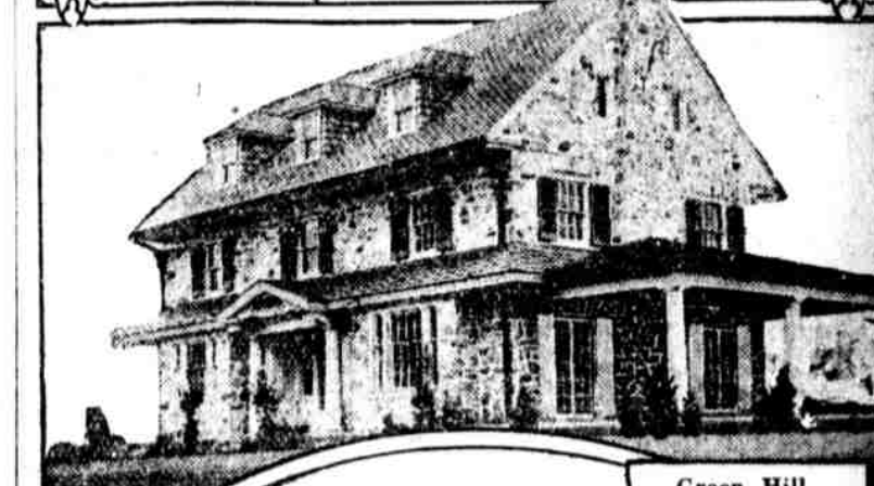
Green Hill City Line Price, $40,000

Overbrook is the most desirable residence section in suburban Philadelphia. These homes are in one of the choicest locations in Overbrook—the Morris Estate. Substantially built according to the design of famous architects.