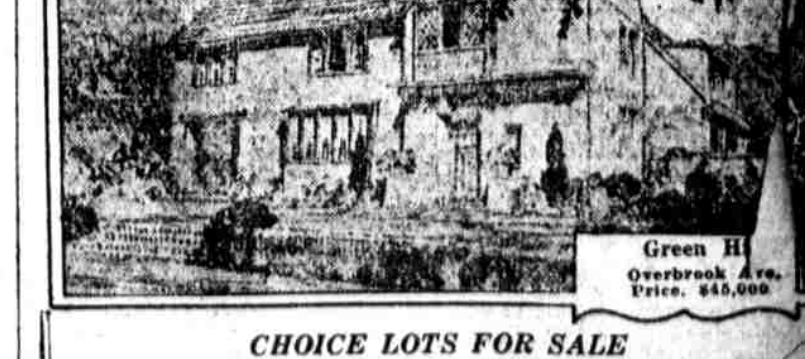
Green Hill Overbrook Ave. Price, $45,000

CHOICE LOTS FOR SALE MORRIS WOOD, Manager 64th Street and City Line