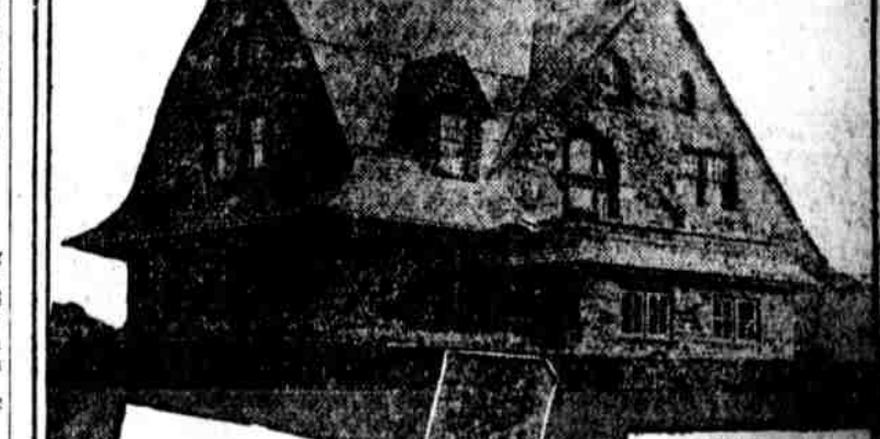
Bala 2418 Colt Road $20,000

Prices quoted below are subject to 10% discount