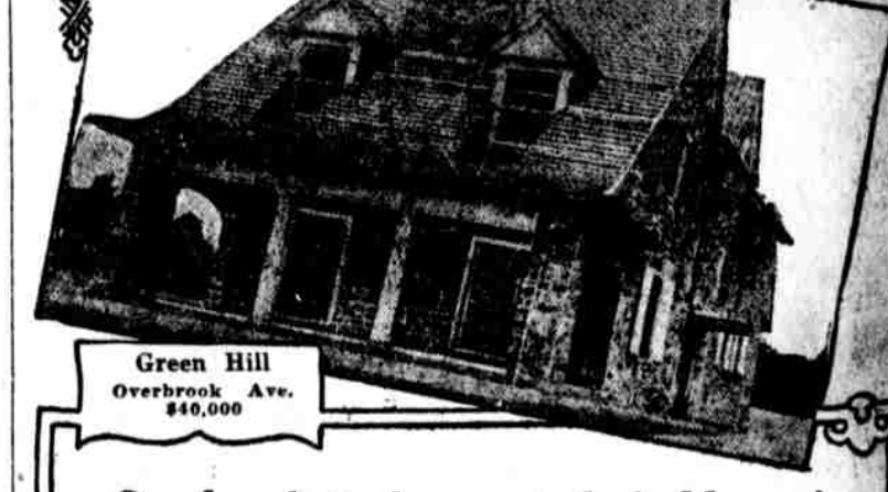
Green Hill Overbrook Ave. $40,000

Overbrook is the most desirable residence section in suburban Philadelphia. These homes are in one of the choicest locations in Overbrook—the Morris Estate. Substantially built according to the design of famous architects.